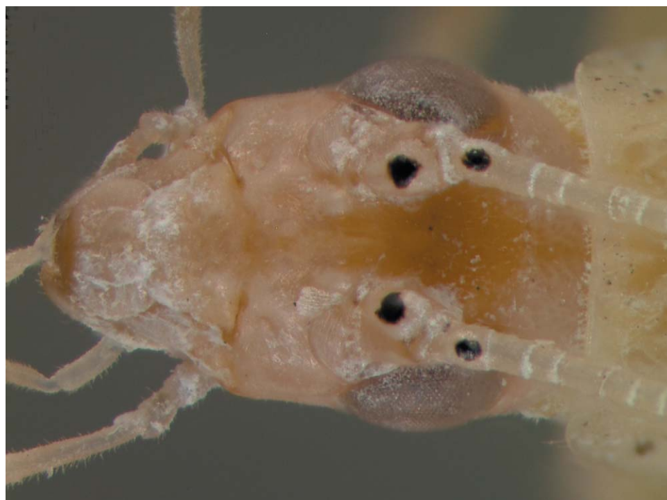
Fig. 1. Antennal markings of holotype of O. alexanderi . For color version, see Plate XIV.

In Fig. 3, the five determinations of chirp rates for Mexican O. alexanderi are by RDA as given to TW in 1966 and are from Michoacan (Tuxpan), Tamaulipas (Ciudad Victoria), and San Luis