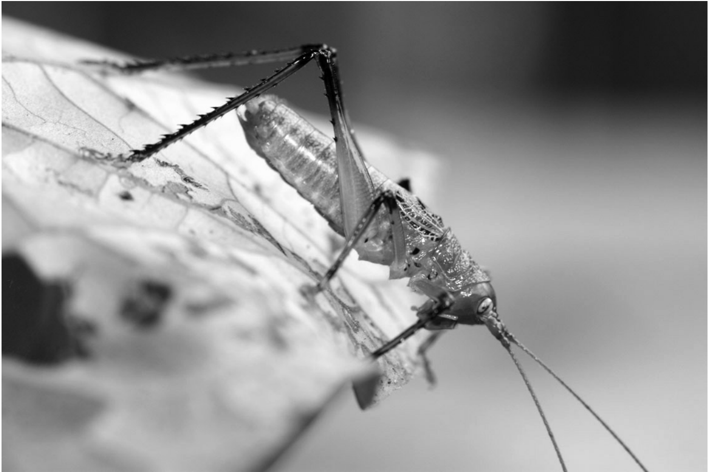
Fig. 2. Male (individual cbt017s06). For color version, see Plate III.