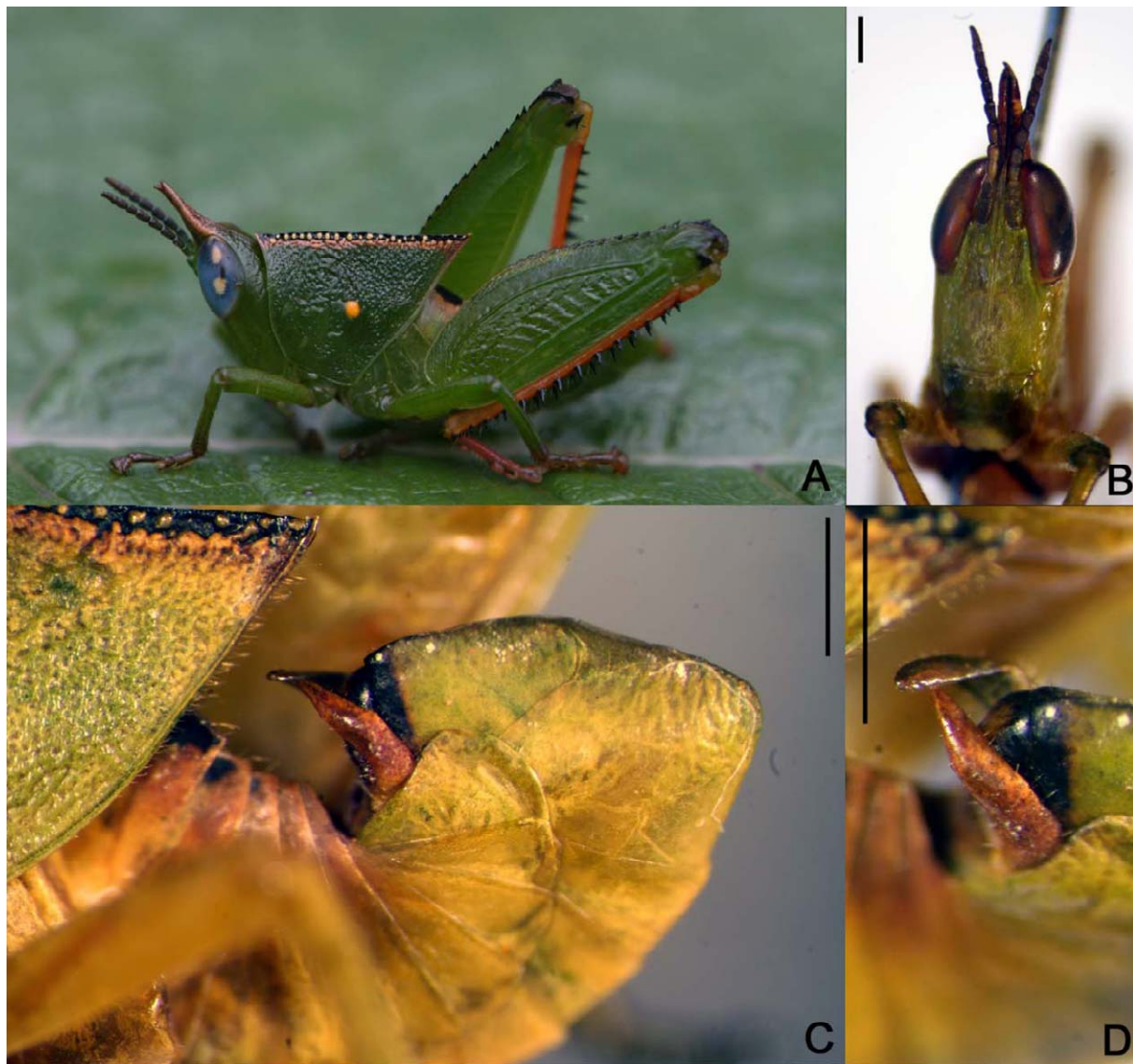
Fig. 1. Plagiotriptus discolor n.sp. A. Male holotype, forest edge of lower border of montane forest on Mt. Vuria, 1950 m in the Taita Hills of Kenya. B. Face and elongated fastigium verticis, holotype male; C. Detail of apex with upturned subgenital plate and cerci, paratype. D. Male cerci, dorsal-lateral view. Scale bar: 1 mm. For color version, see Plate VI.

ate; alae red; Tanzania, East Usambara, Uluguru . . . . . . . . . . P. carli (C. Bolivar, 1914) 9 ♂ Tegmina reduced but wing-like and reaching past posterior edge of 2nd abdominal tergite; tegmina and alae bluish white of mat mildew appearance; Tanzania, Udzungwa Mts . . . . . P. peterseni Johnsen, 1986