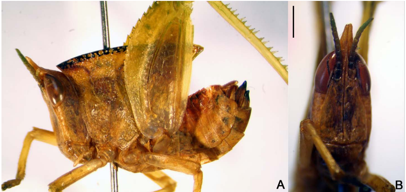
Fig. 3. Female paratype (last instar) of Plagiotriptus discolor n.sp.; A. Habitus, lateral view; B. Face. Scale bar: 1 mm. For color version, see Plate VI.