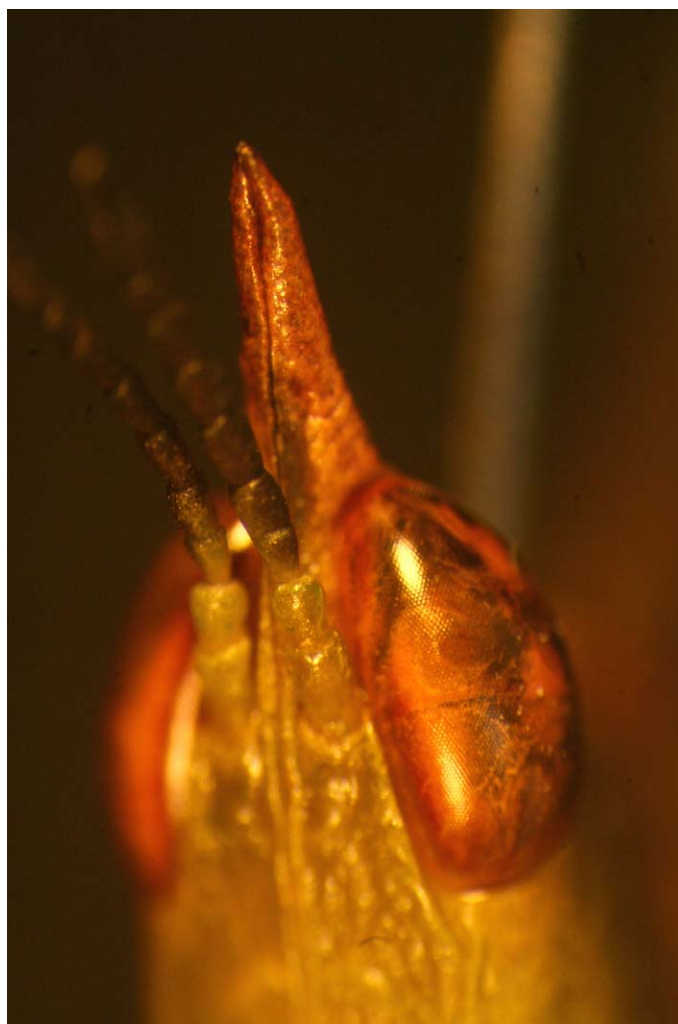
Fig. 2. Dorsal view on part of face and elongate sulcate fastigium verticis of male Plagiotriptus discolor n. sp. For color version, see Plate VI.

Co-occurring Saltatoria species. — Rhainopomma montanum (Kevan, 1950), Parasphena teitensis Kevan, 1948, Aerotegmina sp., Melanoscirtes taitensis Hemp, 2010, Ixalidium haematocelis Gerstaecker, 1869, and Gymnobothroides pullus montanus (Kevan, 1950).