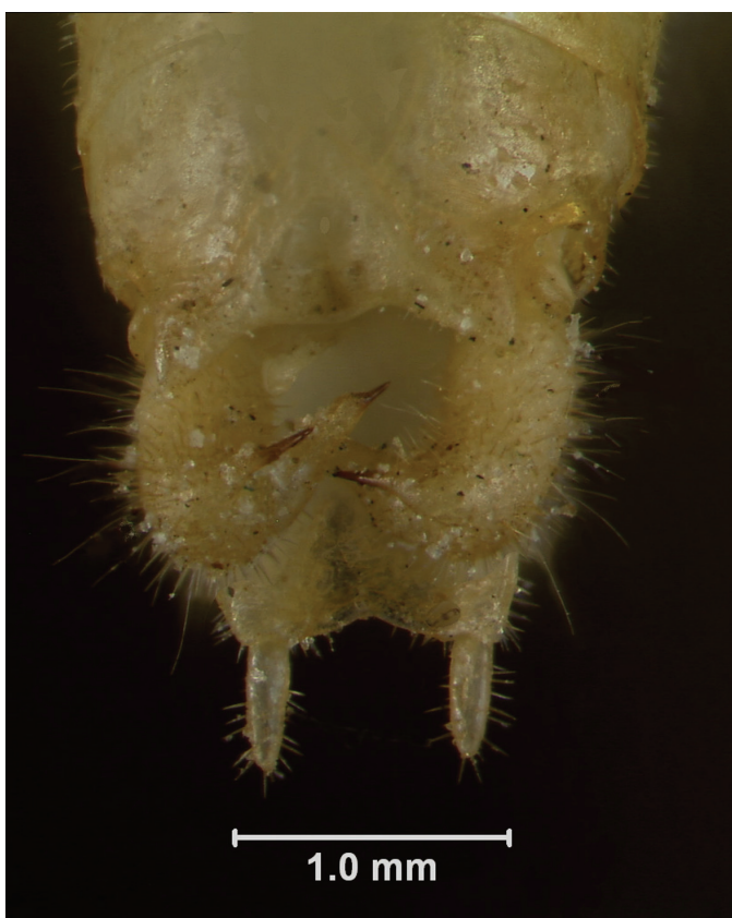
Fig. 2. Terminalia of holotypic male. The cerci are above the subgenital plate and its cylindrical styli. Each cercus has two subapical spines. The outer spine has a minimal basal piece whereas the inner spine has a substantial one (the inner spine of the right cercus is not visible in this image).

Habitat/behavior. — At Kitt Peak, 7Jun2013, all males and females were on perennial bunch grasses in open, mixed grass-shrub habitat;