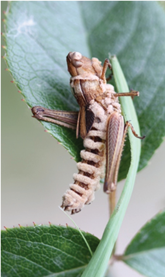
Fig 1. Chorthippus angulatus killed by Entomophaga grylli in Kazakhstan. Photo V.L. Kazenas. Reproduced by permission.

all of Kazakhstan. In most cases the dead insect collections were made in the areas of high-density grasshopper and locust populations and known disease occurrence. Dead insects exhibiting the "summit disease" signs were collected mostly from the stems of various plants, placed into plastic or glass vials sterilized with 70% EtOH, and stored at +4°C for subsequent examination. In case there was no visible mycelium on the insect body, the specimens were placed into a "wet chamber" until the sporulation started. The "wet chamber" represented a Petri dish bottom with a round piece of filter paper soaked with distilled water and closed with a Petri dish lid (Evlakhova & Shvetsova 1965, Issi et al. 1993). Identification of the pathogen was done by examining the conidia under the microscope MBI-15 (magnification 40× and 90×), measuring the spore size by an ocular micrometer MOB-1-15×, and following the keys of the "Guide to entomophilous fungi of the USSR" (Koval 1974).