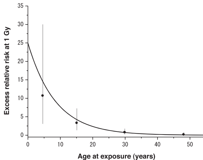
FIG. 2. Solid line shows excess relative risk at 1 Gy with age at exposure modification for basal cell carcinoma based on the linear model with a threshold at 0.63 Gy. Dots show excess relative risk point estimates by age at exposure categories, 0–9, 10–19, 20–39, over 40 years old at the time of bombing and the 95% confidence bounds were also estimated.

hood ratio test, P = 0.15 ) based on the joint analysis proposed by Pierce and Preston (17, 23). For BCC in the area likely to be exposed to UV radiation, the background rate and the EAR (cases per m^2 \cdot 10^5 \text{ years Gy} ) were estimated to be 23 and 40 (95% CI: <0, 106 ), respectively. The comparable rates in the area unlikely to be exposed to UV radiation were estimated to be 1.0 and 5.7 (95% CI: 1.9, 11), respectively. These were based on a linear model with background parameters (city, gender, period at diagnosis and attained age) and effect modifier (age at exposure and attained age).