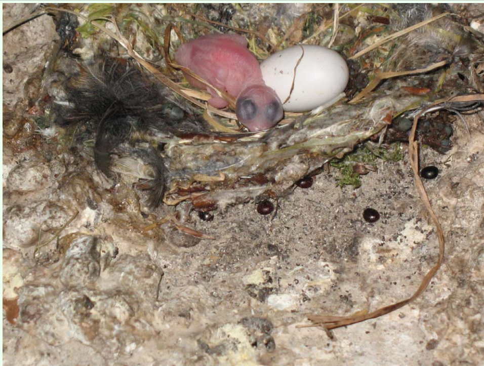
Figure 4. Pupae deposited to the side and beneath the nest. Two of the pupae are a dark brown in colouration, indicating that they have only recently been deposited. Pupae are typically black in colouration. Beneath the nest to the right is a small aggregation of adult Crataerina pallida that may be the result of mating competition. High quality figures are available online.

Other factors, such as the weather or climate, may also influence C. pallida numbers. A correlation between the abundances of a louse fly species on Serins, Serinus serinus , and the weather has been seen (Summers 1975). Recently fledged nestlings of the north island robin Petroica australis were more likely to be parasitized by C. pallida if they came from wetter territories (Berggren 2005).