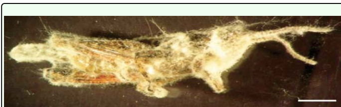
Figure 3. Fusarium verticillioides on third-instar nymphs of Ronderosia bergi 48 h after death. Scale bar: 14 mm. High quality figures are available online.

The means by which the infection of T. collaris and R. bergi by F. verticillioides might have been effected is not clear, but Kilpatrick (1961) stated that the entry of the fungus into the insect could occur via the oral route, oviposition tubes or wounds.