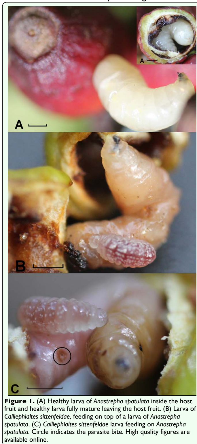
Figure 1. (A) Healthy larva of Anastrepha spatulata inside the host fruit and healthy larva fully mature leaving the host fruit. (B) Larva of Calliephialtes sittenfeldae , feeding on top of a larva of Anastrepha spatulata . (C) Calliephialtes sittenfeldae larva feeding on Anastrepha spatulata . Circle indicates the parasite bite. High quality figures are available online.

The fruiting season of S. schreberi takes place from early January to late March. Each fruit contained only one larva of A. spatulata . Females of C. sittenfeldae were observed from the 12 February to 26 February in 2006 and 2007. Host seeking activity was mostly recorded from 09:00 to 13:00 and from 15:00 to 17:00. The temperature ranged from 7.8 to 35.7 °C (average 18.6 °C) and relative humidity from 24.3 to 99.8% (Average 80.5). Female C. sittenfeldae were observed seeking for fruit fly hosts in ripe fruit only. This suggests that female parasitoids prefer to parasitize larvae of A. spatulata that have reached the third instar, because unripe fruit predominantly contain early instar larvae of the fly. Dissections of infested ripe fruit revealed that 100% of the larvae had depleted all the resource (the seed of the fruit) and all were fully mature, ready to leave the fruit and pupate (Figure 1A). Female parasitoids detected infested fruit, inserting the ovipositor