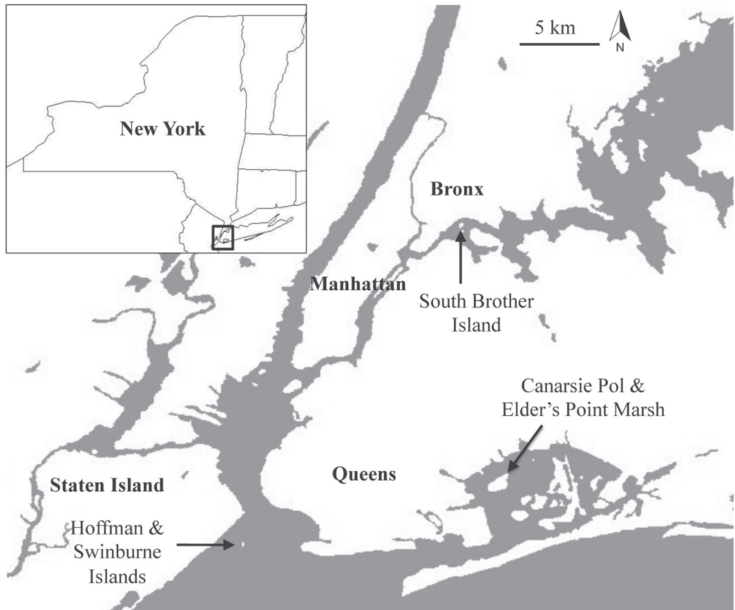
Figure 1. Map of the New York Harbor estuary indicating locations where feather samples were collected: Lower Bay (Hoffman and Swinburne Islands), East River (South Brother Island), and Jamaica Bay (Canarsie Pol and Elder's Point Marsh).

is a natural island situated between Riker's Island and the Bronx, New York. Aquatic habitat near South Brother Island ranges from brackish to freshwater.