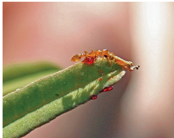
FIG. 1. An early instar A. t. floridalis being predated by a Pseudomyrmex pallidus in Long Pine Key on 24 February 2009.