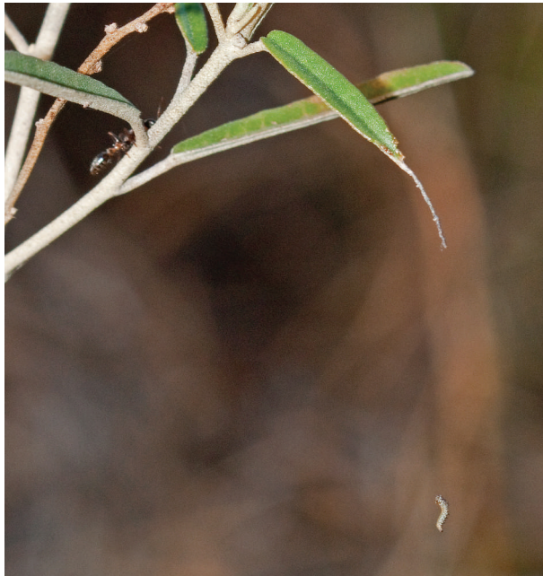
FIG. 2. An early instar A. t. floridalis larva evading predation from Pseudomyrmex gracilis in Long Pine Key on 26 February 2011 (Photo: H.L. Salvato).

Greeney et al. 2012). Pseudomyrmex pallidus occurs commonly from the southern United States to Central America and nests opportunistically within the hollow branches of various herbaceous plants (Ward 1985). We have frequently observed P. pallidus patrolling on, and visiting the flowers of, pineland croton, Croton linearis Jacq. (Euphorbiaceae), the only known hostplant for A. t. floridalis .