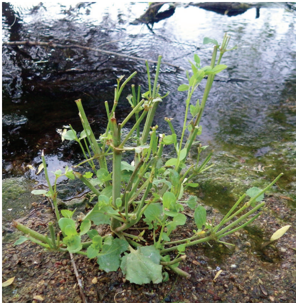
FIG. 2. Damage to Mimulus guttatus from Junonia coenia (Maricopa Co. AZ).

herbivores may use at least some PPGs as feeding stimulants (Holeski et al. 2013). Many plant species within the Scrophulariaceae sensu lato (where Phrymaceae was once included) contain PPGs (Mølgaard & Ravn 1988). This shared phytochemistry leads to many of the same specialist herbivores feeding from plants across the Scrophulariaceae sensu lato (Bowers 1988). Despite its defenses, herbivory on M. guttatus can still be very damaging to plants (Fig. 2).