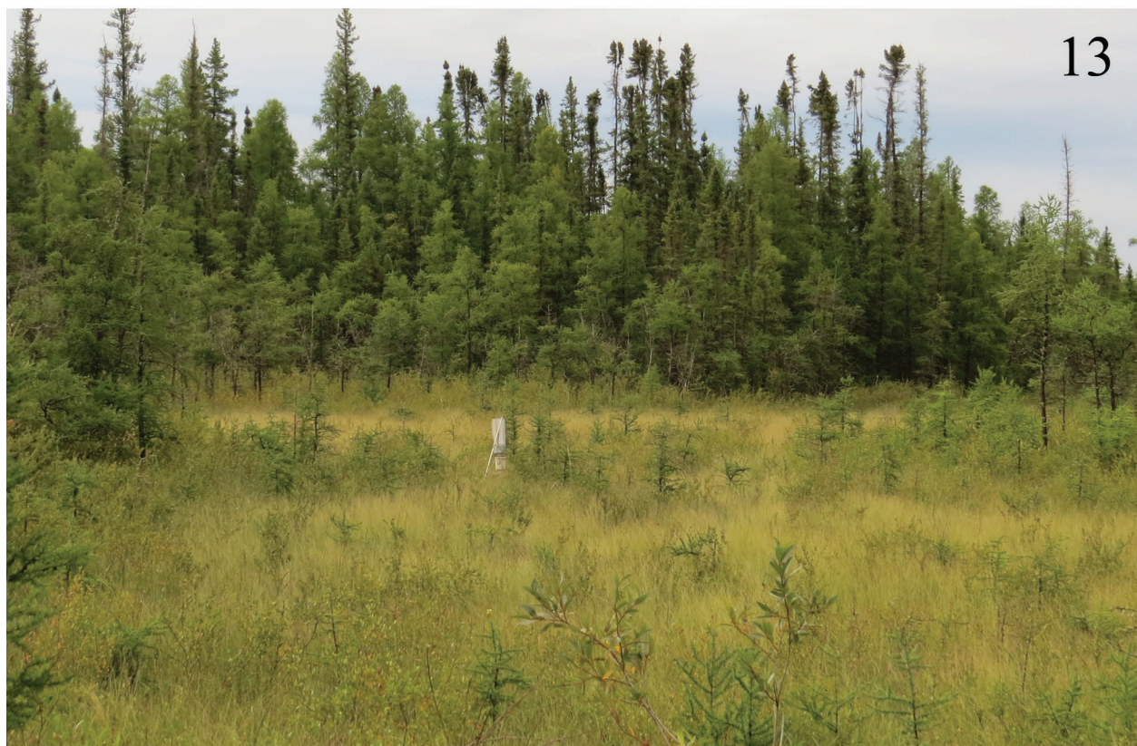
FIGS. 12–13. 12. Distribution of Papaipema aweme larvae (yellow circles) and adults (red squares n = 1-2 ; red star n = 9 ) at the Pine Creek Peatland on the Minnesota-Manitoba border. Habitats range from open rich fen to rich swamp; patterned types include spring fen channels (left) and ribbed fen (lower center). The points span 1.9 km. 13. Potential Papaipema aweme habitat near Aweme, Manitoba (August 24, 2016). Spring fen channel open graminoid rich fen bordering Larix laricina ( Picea mariana ) rich swamp groves. Menyanthes trifoliata is abundant. A UV light trap is visible in the photo center.