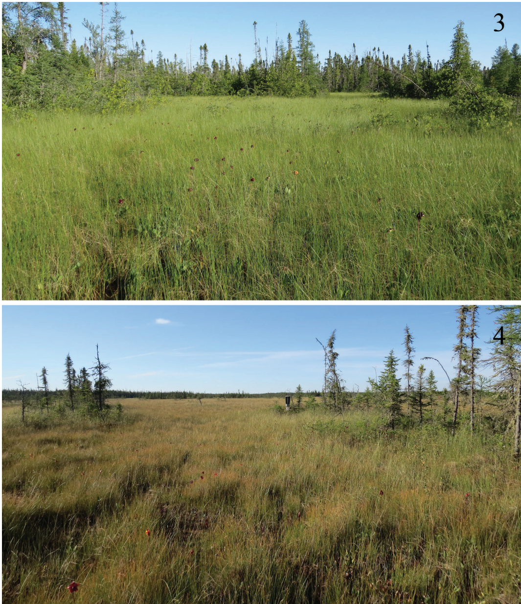
FIG. 3-4. 3. Papaipea aweme habitat, Pine Creek Peatland, Roseau Co., Minnesota (June 23, 2016). Spring fen channel open graminoid rich fen; this is bordered by Picea mariana ( Thuja occidentalis - Larix laricina ) rich swamp. Menyanthes trifoliata is abundant. 4. Papaipea aweme habitat, First Central Lake, Northern Region, Manitoba (August 21, 2016). Graminoid reticulate ribbed rich fen with Picea mariana - Larix laricina - Sphagnum -ericad tree islands; Menyanthes trifoliata is abundant.

biased to areas where adults were captured, and toward host plants with distributions that fit the general range of historical captures of the moth. We paid particular attention to the following plants: Cladium mariscoides (Muhl.) Torr. (Cyperaceae), Menyanthes trifoliata L. (Menyanthaceae), Pedicularis lanceolata Michx. (Scrophulariaceae), native genotype of Phragmites australis (Cav.) Trin. ex Steud. (Poaceae), Sarracenia purpurea L. (Sarraceniaceae), Triglochin maritima L.