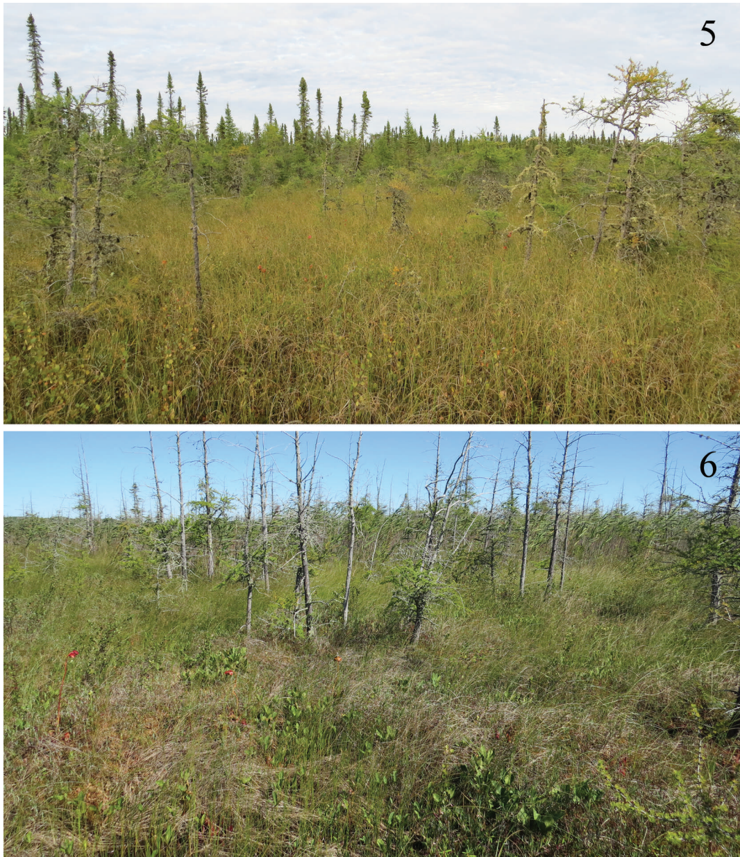
FIGS. 5–6. 5. Papaipema aweme habitat, Deschambault Lake, Division No. 18, Saskatchewan (August 22, 2016). Narrow open graminoid rich fen water track through semi-treed Picea mariana-Larix laricina-Sphagnum-ericad rich to poor fen. Menyanthes trifoliata is abundant. 6. Papaipema aweme habitat, Agassiz Peatland, Rainy River District, Ontario (August 29, 2016). Sparsely treed Larix laricina-graminoid-Sphagnum-ericad rich fen along featureless margin of patterned water track. Menyanthes trifoliata is abundant.