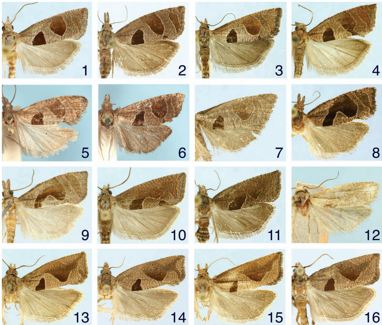
FIGS. 1–16. 1–7, E. dorsisignatana . 1, ♂, Adams Co., Ohio. 2, ♀, Ithaca, New York. 3, ♂, Larimer Co., Colorado. 4, ♂, Halifax, Nova Scotia. 5, P. clavata lectotype. 6, C. distignana holotype. 7, E. d. diffusana lectotype. 8–9, E. similiana , form confluana . 8, ♀, Hamilton Co., Ohio. 9, ♂, Susquehanna Co., Pennsylvania. 10–11, E. similiana , form diffusana , ♂, ♂, Hamilton Co., Ohio. 12, E. engelana , lectotype. 13–16, E. oraria . 13, Holotype. 14, ♀, Accomack Co., Virginia. 15, ♀, Northampton Co., Virginia. 16, ♂, Worcester Co., Maryland.