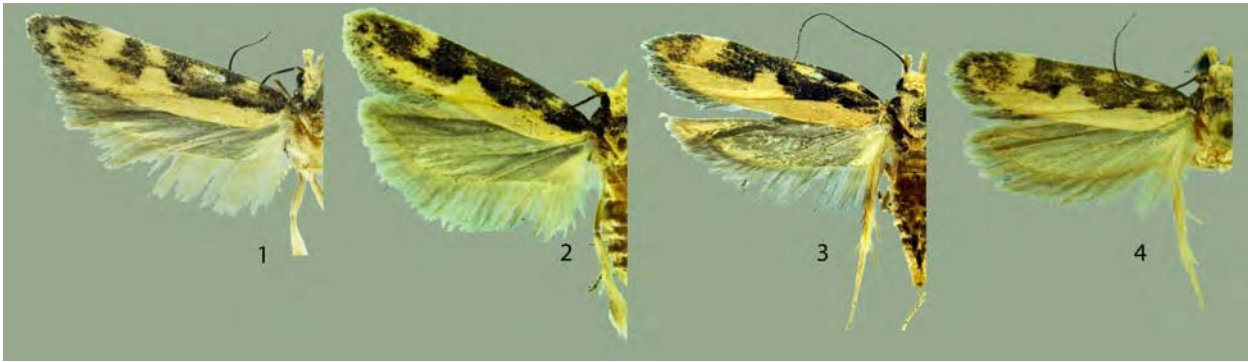
FIGS. 1–4. Chionodes hodgesorum adults; 1. male holotype (Genitalia on slide USNM 144565); 2. female paratype; 3. male paratype; 4. female paratype.

eyepiece of a Wild™ model M5 stereo-microscope at magnification of 6x.