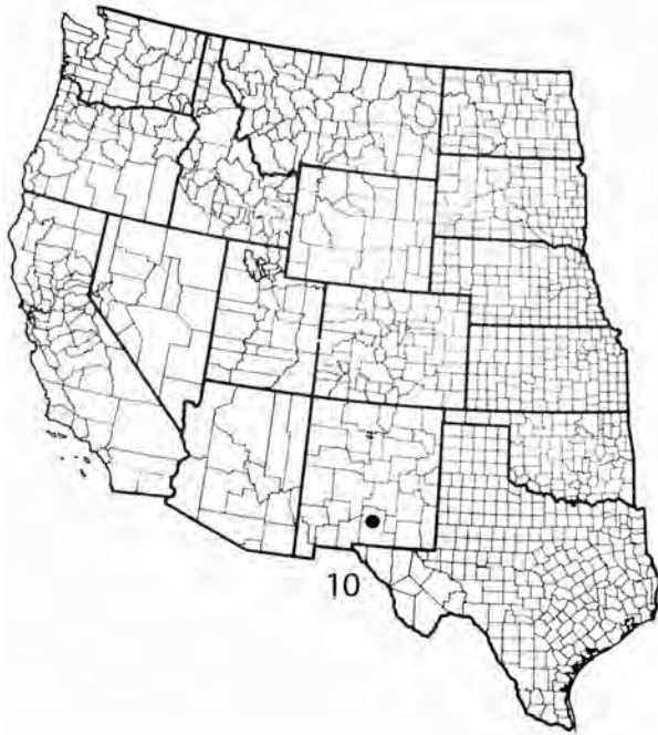
FIG. 10. Chionodes hodgesorum distribution map. Chionodes hodgesorum is known only from White Sands National Monument, Otero Co., New Mexico.

key characters, and descriptions which allowed me to focus on the features of each species which either included it or excluded it from consideration as I distinguished C. hodgesorum . When I sent photographs of the adult and genital preparations to Ron Hodges, he agreed with my diagnosis. One male specimen of C. hodgesorum has a hint of orange in the yellow area of the forewing.