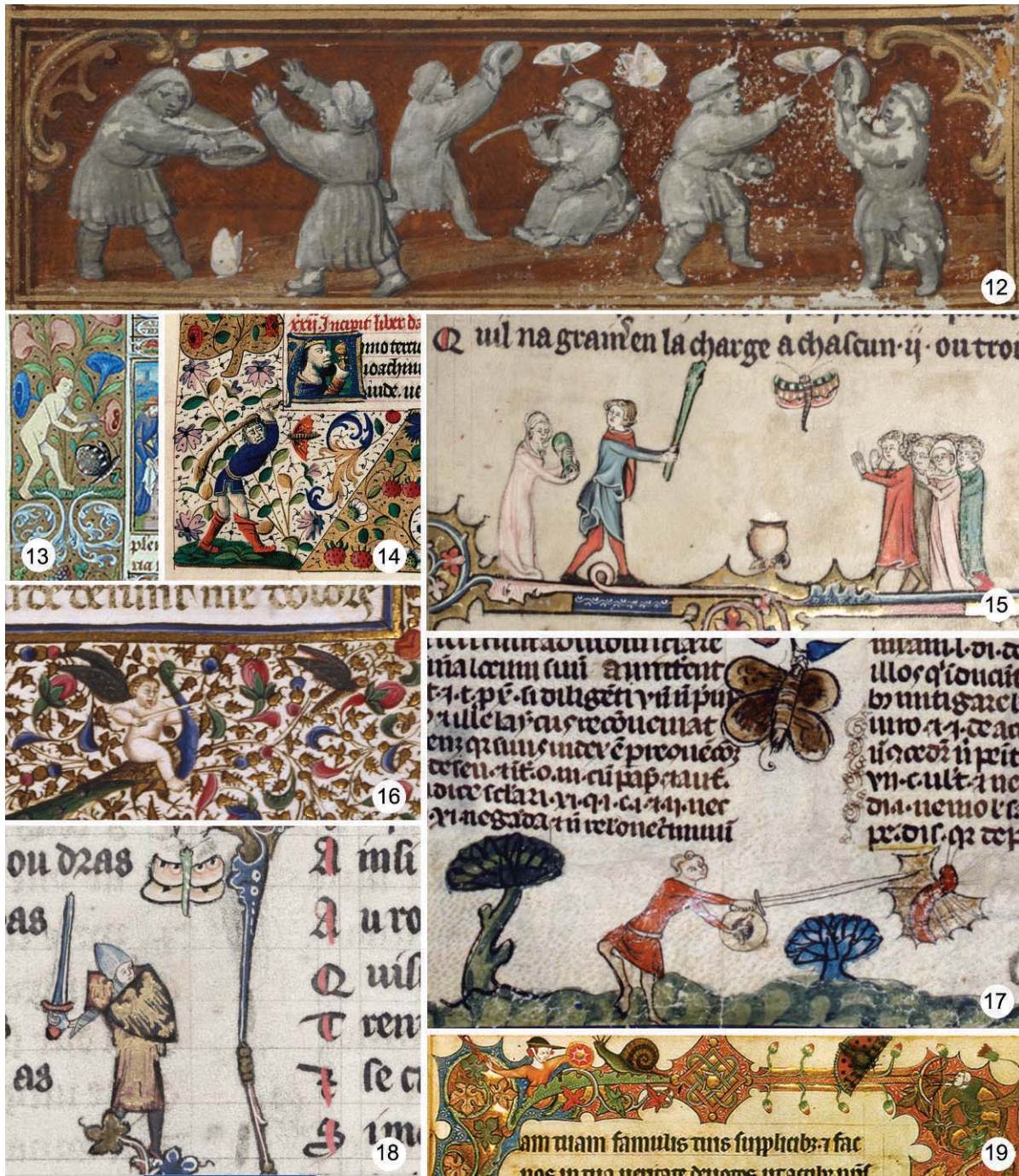
FIGS 12-19: 12 ) Book of Hours , Use of Rome (the 'Golf Book'), 1540, Netherlands, The British Library Board, MS 24098, f. 24v; 13 ) Book of Hours , 1495-1503, France (Rouen), Pierpont Morgan Library, New York, MS M.0261, f. 78r; 14 ) Breviaire à l'usage de Langres , after 1481, Eastern France (Bourgogne ?), Chaumont, Bibliothèque municipale, MS 0033, f. 119v; 15 ) Romance of Alexander , 1338-1344, France (Flemish), attributed to various authors including Lambert le Tort, Alexandre de Bernai (de Paris), Jehan de Grise and others, Bodleian Library Oxford, England, MS Bodl. 264, pt. I, f. 44r; 16 ) Book of Hours , Dominican use, 1458-1465, Italy, Houghton Library, Harvard University, Cambridge, Massachusetts, MS Typ 463, f. 97; 17 ) Decretals of Gregory IX with glossa ordinaria (the 'Smithfield Decretals'), Last quarter of the 13th century or 1st quarter of the 14th century, Southern France (Toulouse?), The British Library, Royal MS 10 E IV, f. 91v; 18 ) Romance of Alexander , 1338-1344, France (Flemish), attributed to various authors including Lambert le Tort, Alexandre de Bernai (de Paris), Jehan de Grise and others, Bodleian Library Oxford, England; MS Bodl. 264, pt. I, f. 41r; 19 ) Ormesby Psalter , Mid 14th century, England (East-Anglia?), Bodleian Library, Oxford, England, MS Douce 366, f. 38r.