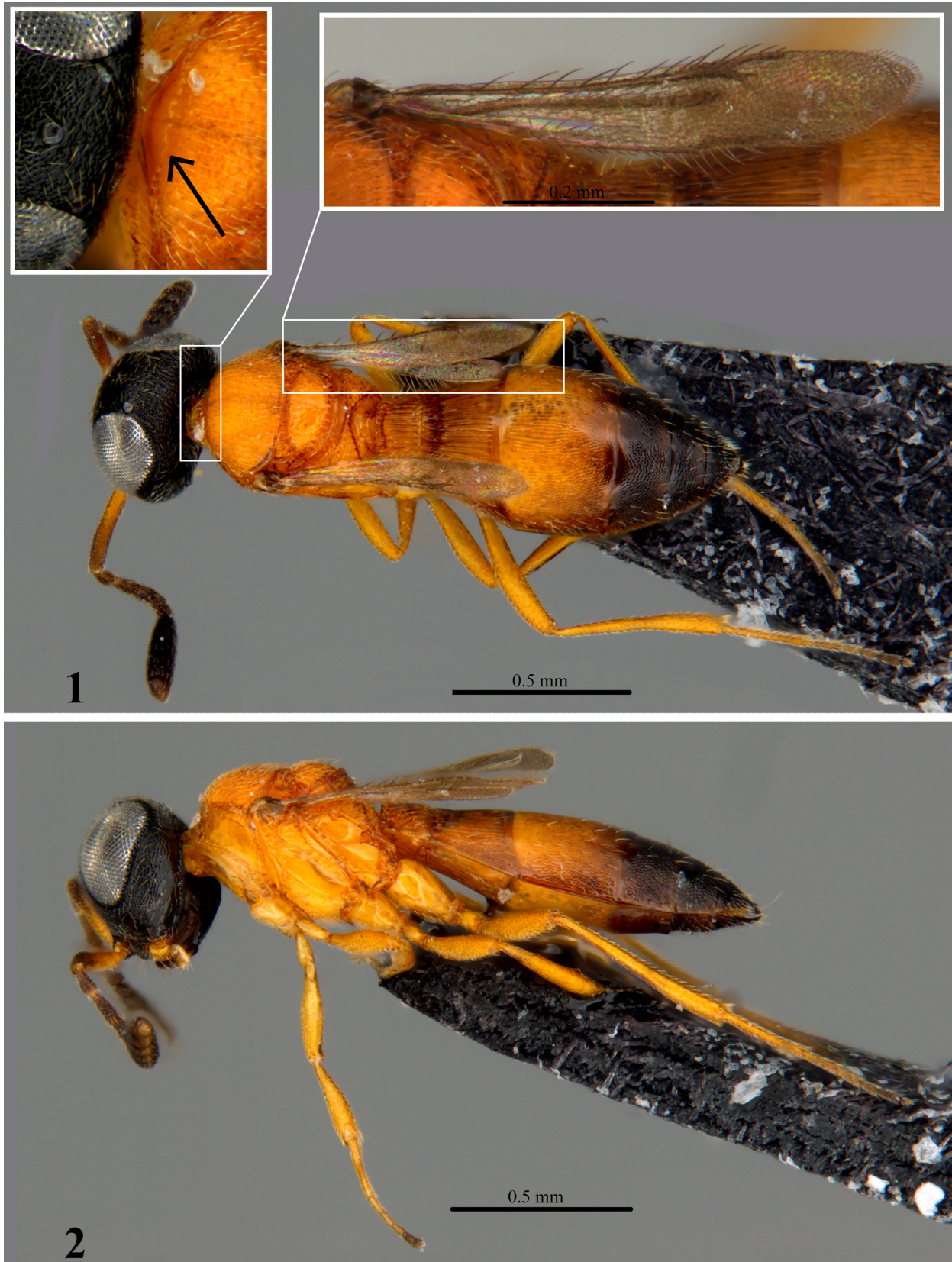
Figs. 1–2. Habitus of Holoteleia nigriceps . 1. Dorsal view with detail of skaphion (left) and fore wing (right). 2. Lateral view.