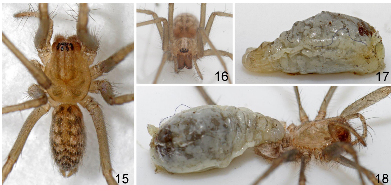
Figs. 15–18. Larva of Cyrtus sp. reared from female Eratigena sp. from Spain. The fly did not reach adulthood. 15. Eratigena sp. in dorsal view. 16. Eratigena sp. in frontal view. 17. Cyrtus sp. larva in lateral view. 18. Cyrtus sp. larva emerging from Eratigena sp. in lateral view.