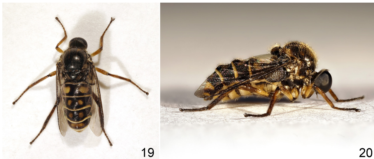
Figs. 19–20. Male Ogcodes guttatus Costa, 1854 reared from Pseudicius sp. from Rhodes (Greece). 19. Dorsal view. 20. Lateral view.

Note: at the time of collecting, the sluggish adult fly, which appeared to have eclosed from its pupa recently, was sitting on the spider remains.