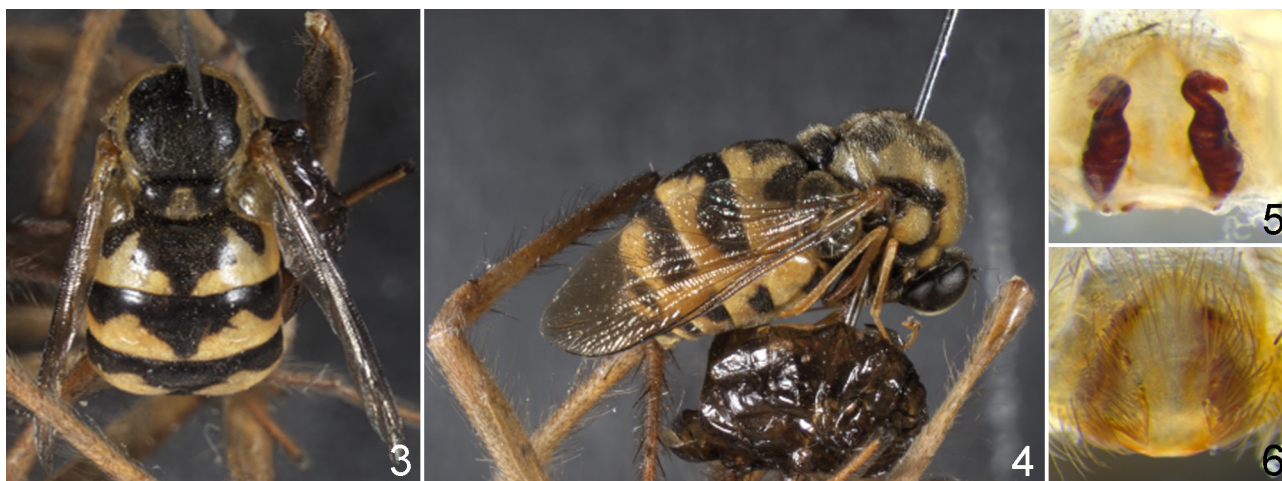
Figs. 3–6. Female Cyrtus gibbus (Fabricius, 1794) reared from a female Eratigena saeva (Blackwell, 1844) from Spain. 3. C. gibbus in dorsal view. 4. C. gibbus in lateral view. 5. Vulva of E. saeva in dorsal view. 6. Epigyne of E. saeva in ventral view.

Identification of host: based on comparison with adult individuals from the same locality (SCHÄFER 2020), identified using METZNER (1999).