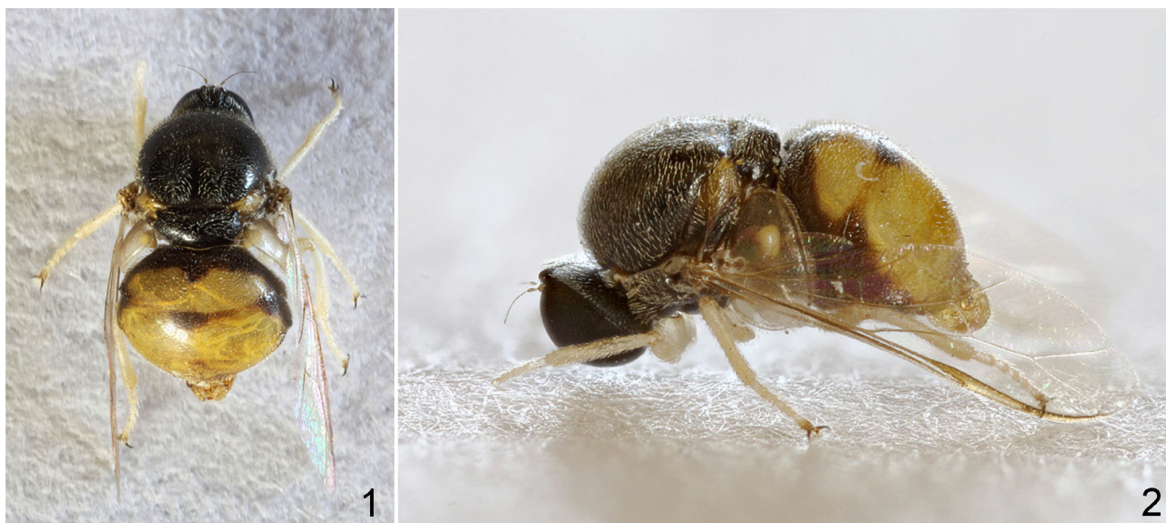
Figs. 1–2. Male Acrocera (Acrocera) orbiculus (Fabricius, 1787) reared from Macaroeris sp. from Tenerife (Canary Islands, Spain). 1. Dorsal view. 2. Lateral view.

Fly (male) eclosed from pupa: no exact date recorded; approximately one week after the larva emerged from the host.