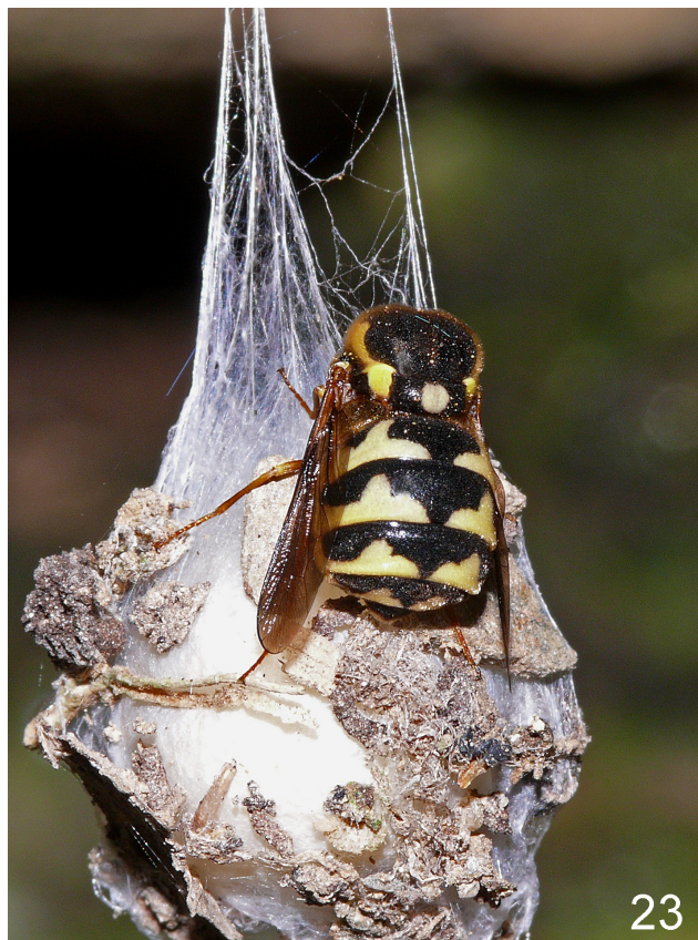
Fig. 23. Adult Cyrtus sp. sitting on an egg-sac, presumably of Eratigena sp.

Fly (female) eclosed from pupa: no exact date recorded; approximately one week after the larva emerged from the host.