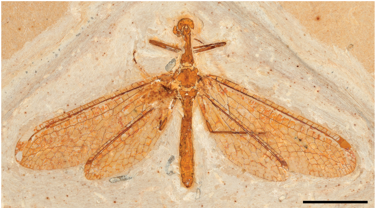
Fig. 1. Karenina cuneiformis sp. nov., holotype, OMNH TI 530 (part). – Scale: 10 mm.

Forewing elongate-oval, rounded apex, 28 mm long, 8.4 mm wide (length/width ratio 3.3). Costal space narrow, composed of 35 cells, humeral veinlet stout and apparently cuneiform in shape with slightly semi cylindrical (Fig. 3b), all subcostal veinlets simple, pterostigma preserved. Sc fused with RA distad, veinlets of Sc + RA simple, three veinlets connected by crossveins. Subcostal space very narrow, crossvein not detected. Stem of RP straight, origin inclined at acute angle to RA. RA space (between RA and RP) broadest at proximal third, narrowed distad, with 20 (right wing) and 17 (left wing) cells. RP divided into nine zigzagged branches, forked only marginal forks. Radial crossveins numerous, forming irregular gradate series, partly reticulate. No crossvein between stem of RP and M. M basally fused with R nearly humeral veinlet, divided into MA and MP; MA arched, slightly zigzagged distally; MP slightly zigzagged. Basal crossvein m-cu located slightly distal to origin of M. Cu originated at wing base, divided into CuA and CuP at basal crossvein m-cu; CuA straight proximally, connecting stem of MP and first intramedian cell (im), strongly zigzagged distally with terminal branches; CuP relatively short, with terminal fork; two crossveins between CuA and CuP. Anal vein poorly preserved, two crossveins between CuP and A1.