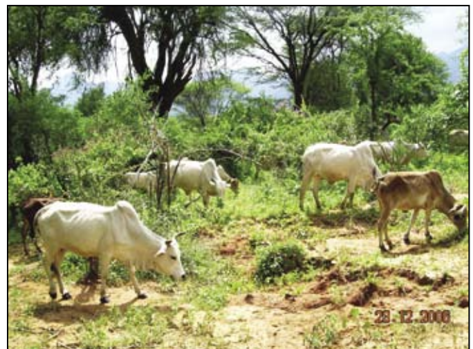
Figure 3. Livestock grazing at Sitin, adjacent to an important area for de Brazza's monkeys in the Mathews Range, Kenya.