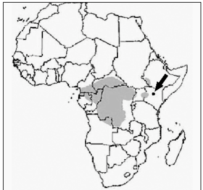
Figure 1. The map of distribution of de Brazza's monkey ( Cercopithecus neglectus ) in Africa, showing the newly discovered population in Mathews Range Forest Reserve (black dot), the first record of the species east of the Great Rift Valley.

A total of 162 de Brazza's monkeys in 24 groups were counted during the survey. These included 139 adults and sub-adults and 23 infants (Table 1). These were found in ten separate laggas throughout the mountain range, save for the northwestern part where the presence of the species needs to be investigated further. By extrapolating information gathered on this study—from interviews and field observations—the population of the entire Mathews Range Forest Reserve was estimated at 200–300. The first ever record of de Brazza's monkey occurring above 2,100 m above sea level was recorded in the Mathews Range at 2,203 m at Olkaela.