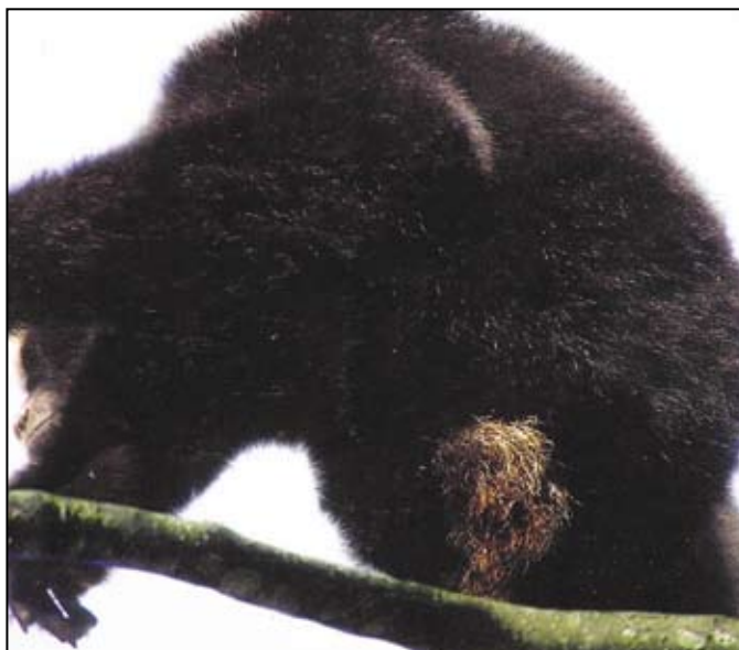
Figure 2. Adult male eastern hoolock gibbon ( Hoolock leuconedys ) showing the genital tuft.

This range extension lies between the rivers Dibang and Lohit. Although further, more detailed, studies are needed, it is evident that forest loss and fragmentation due to expansion of tea gardens, ginger and mustard cultivation, horticulture, jhum cultivation, and rice paddies is a major threat to the species in this area. In 2007, a team of forest officers of the Arunachal Pradesh government, under the supervision of Mr. C. Loma of the Deputy Conservator of Forests (DCA) (Director, Biological Park, Itanagar), rescued 12 individuals of eastern hoolock gibbon (in four groups) from the Dello village in the Koronu Circle area in the Lower Dibang valley district. The gibbons had been trapped in a very small remnant forest with very few trees left standing. The rescued gibbons are now in the Zoological Park at Itanagar, the capital of Arunachal Pradesh. The Koronu Circle area on the fringe of the Mehao Wildlife Sanctuary and Turung Reserve Forest