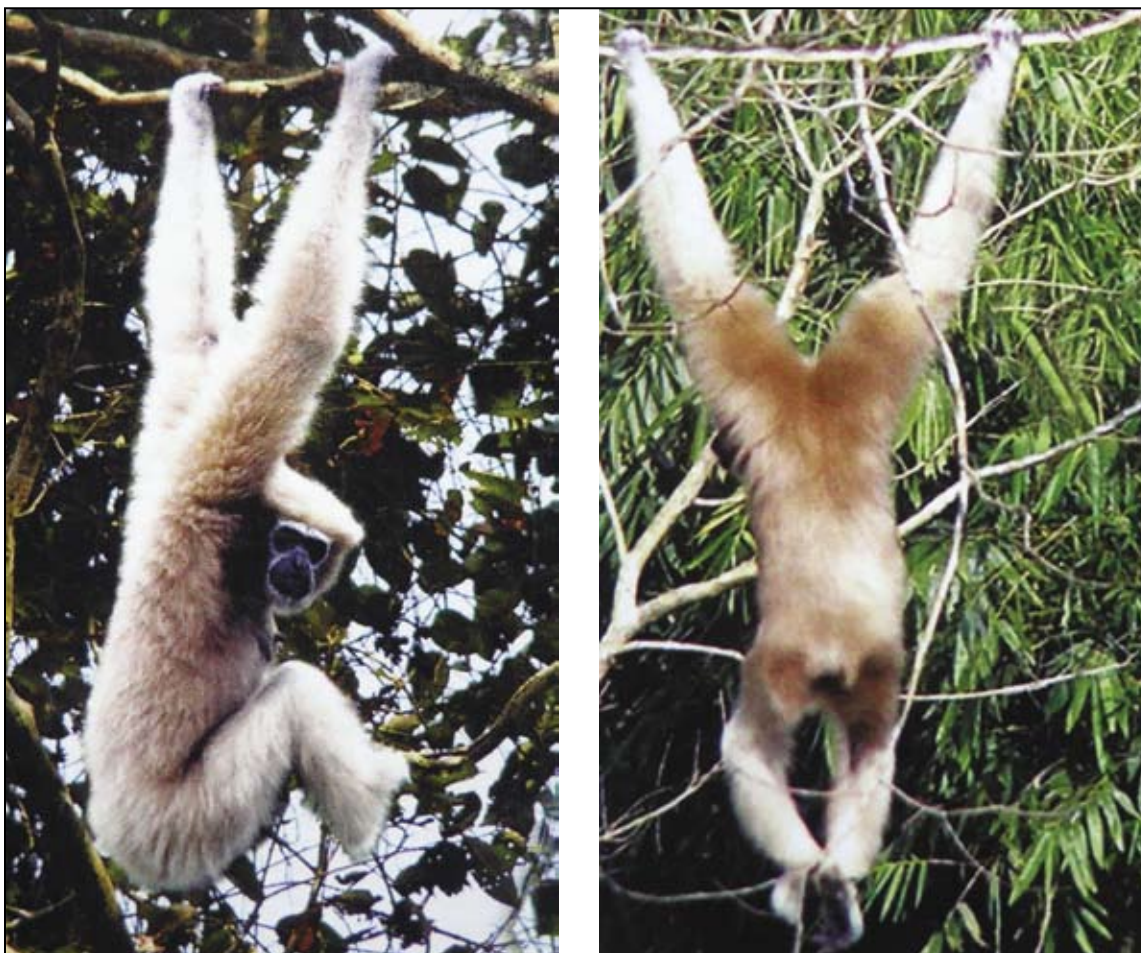
Figure 3. Adult female eastern hoolock gibbon ( Hoolock leuconedys ).