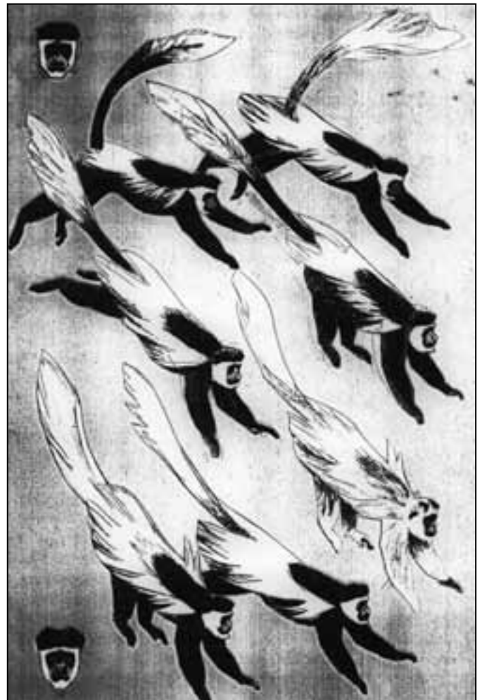
Sketches by Pierre Dandelot. Black-and-white colobus leaping. Original with Colin P. Groves.