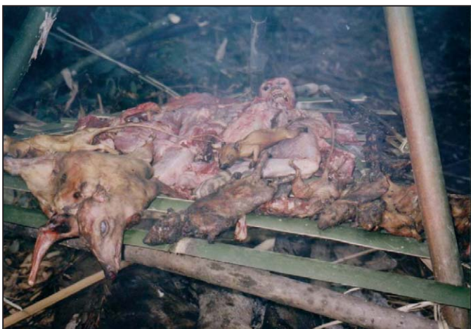
Figure 3. The head of a hunted Phayre's leaf monkey Trachypithecus phayrei , being cooked as part of professional hunters' haul of mixed wildlife. Muang Sanakham, Vientiane province, Lao PDR, 30 October 2000.

Muang Sanakham, Vientiane province. A skin and head (Fig. 3) were seen at a hunters' camp beside the Houay Oum (18°07'20"N, 101°29'50"E; c. 300 m) amid hills supporting extensive tall bamboo and riverine forest (Fig. 4) on 30 October 2000 (Hansel 2004, where the record was dated erroneously as 2004 in Table 1); the skull and a photograph of the skin were sent to the Natural History Museum, London, UK (registration number BMNH 2010.310). Although skulls are difficult to identify objectively to species (Pocock 1935), the overall gray color of the skin, especially of the tail, suggests T. p. crepusculus (D. Brandon-Jones in litt. 2011). A group of six (five adults and one young molting from orange to gray pelage) was seen in tall bamboo and secondary growth with remnant tall trees from semi-evergreen forest at Kok Kawdinpang (18°18'05"N, 101°46'49"E, taken from a GPS under WGS84 datum; c. 500 m), east of Ban Phonsavat, in Phou Gnouey Production Forest Area (= PFA) on 6 April 2010 (Suford in press ). Villagers reported near-daily