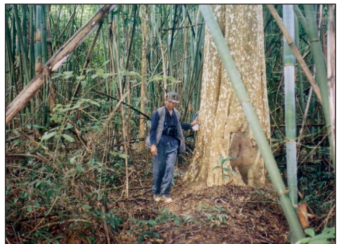
Figure 4. Typical tall bamboo habitat of Phayre's leaf monkey Trachypithecus phayrei , Muang Sanakham, Vientiane province, Lao PDR, October 2000.