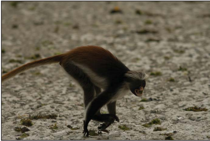
Figure 5. Adult male Zanzibar red colobus Procolobus kirkii running along a sandy beach, Vundwe Island, Zanzibar Archipelago, Tanzania.

Tana, Kenya, where P. rufomitratus lives at high densities of 165 individuals/km 2 (similar to the density of red colobus estimated in Uzi). The farm-field groups in Siex's study (Siex 2003), at a population density more than double of those in the Jozani groundwater forest (550 monkeys/km 2 compared with 235 monkey/km 2 ), were highly unstable and living at high densities because of habitat compression rather than intrinsic growth.