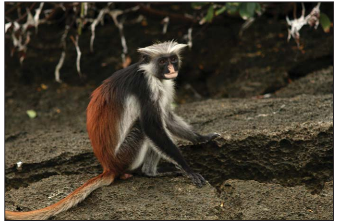
Figure 4. Adult male Zanzibar red colobus Procolobus kirkii sits on jagged coral rock formation, Vundwe Island, Zanzibar.

The results of these surveys, while conducted almost a decade ago, are suggestive of the relative value of degraded habitats to colobus and Sykes's monkeys. This value may