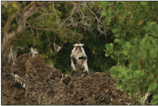
Figure 3. Adult male Zanzibar red colobus Procolobus kirkii eating mangrove flowers on coral rag, southern Uzi Island, Zanzibar Archipelago, Tanzania.

tended to be associated with lower numbers of monkey sightings, with an exception in Uzi, where Sykes's monkey and human encounter rates tended to correlate, suggesting their use of relatively disturbed forest at this site (Table 2).