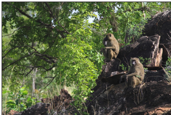
Figure 4. Papio anubis in Arly National Park.

highest, indirect observations (feeding signs) were also highest at 0.316 signs/km. Erythrocebus patas was reported by interviewees to occur regularly around forest edges, in agricultural zones and, while they were not observed in Comoé, they were reported to be frequent crop-feeders by villagers on the border of the AGEREF/CL park.