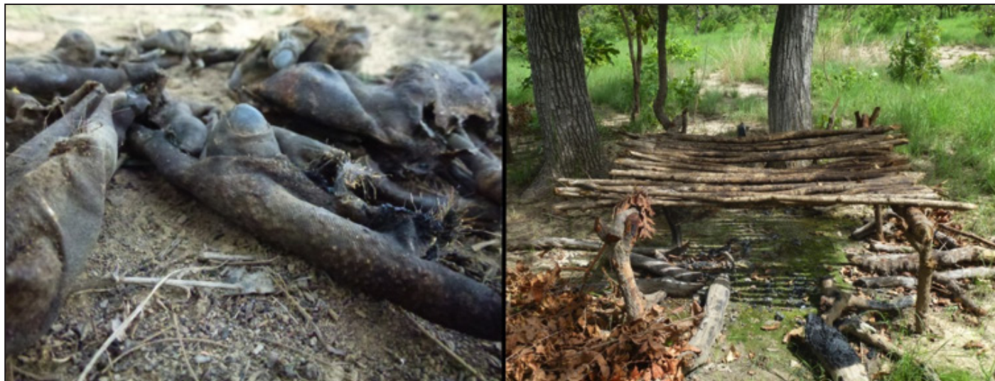
Figure 6. The hands and feet of Papio anubis (left) found near a poaching camp (right) in Comoé-Léraba Partial Reserve, Burkina Faso.