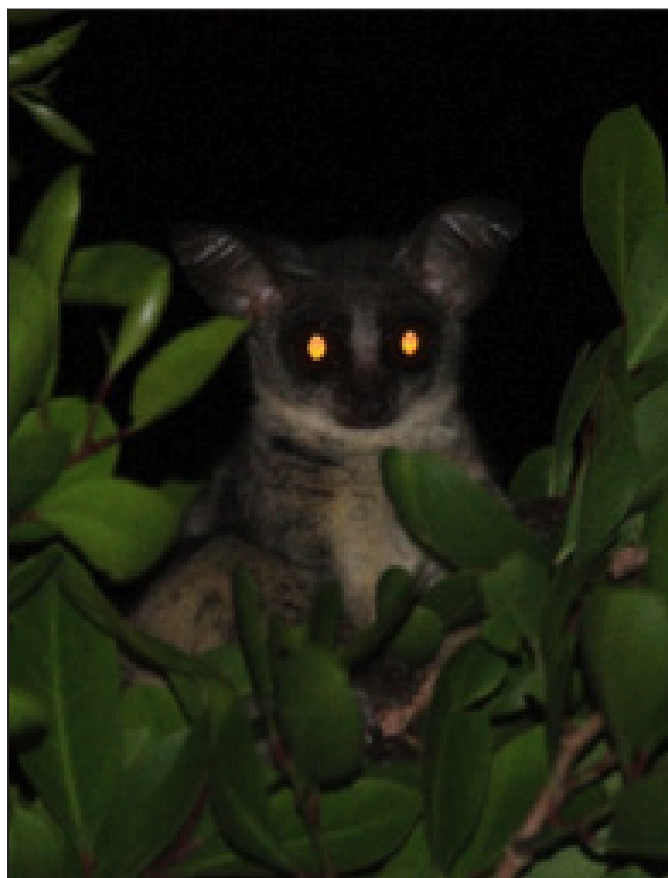
Figure 3. Galago senegalensis observed on the edge of Pama Partial Reserve, Burkina Faso.

Sightings of E. patas were rare, with a total of only five encounters: Pama (1 individual); Arly (one group); Comoé (none); Koulbi (two groups); Nazinga (one group) (Tables 2 and 4). The average observed group size was 2.25 individuals, although patas were difficult to see and quick to flee. The one individual we saw in Pama was well-known to park officials and employees who reported that it had been alone for 10 years. In Koulbi, where group encounter rates were