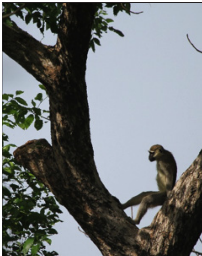
Figure 5. Chlorocebus tantalus in Arly National Park, Burkina Faso.

Our interviews with park officials and anti-poaching patrollers revealed an overall lack in anti-poaching patrol effort and the inability of patrollers to enact the laws in place. These individuals are often placed in dangerous situations, but have been fined or even imprisoned for retaliatory action. Effective and consistent law enforcement in protected areas is vital to species’ survival (Hilborn et al. 2006; Tranquilli et al. 2011; N’Goran et al. 2012). We recommend that the MOE implement a uniform system for assessing and managing wildlife across its protected areas (for example, incorporating data collection into anti-poaching patrols) and that anti-poaching patrollers are trained as law enforcement officials with the authority to detain and prosecute individuals.