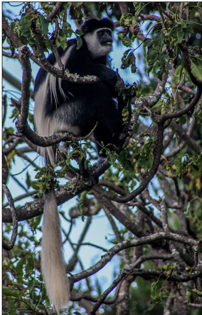
Figure 2. Adult male Mount Kenya guereza Colobus guereza kikuyuensis , Nanyuki, central Kenya. In this subspecies, 71–81% of the tail is white.

Primate surveys were conducted 27–28 September 2014 from a vehicle and on foot by the two authors. Transects were run along dirt roads and foot paths. These were selected to maximize the chances of encountering as many individuals of as many species of primate as possible. As time was very limited, the rapid assessment survey method was used, as described in Butynski and Koster (1994), White and Edwards (2000), and Butynski and De Jong (2012).