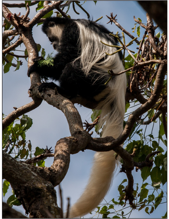
Figure 6. Adult male Mount Kilimanjaro guereza Colobus guereza caudatus , Loitokitok, southeast Kenya. For additional images and localities for C. guereza , visit the 'Colobinae Photographic Map' at < www.wildsolutions.nl >.

(Rodgers 1981; Cordeiro et al. 2005; Doggart et al. 2008; T. M. Butynski and Y. A. de Jong pers. obs.). The absence of C. guereza and C. angolensis from the North Pare Mountains is unexpected given the proximity of these mountains to populations of these two species; C. guereza at Kileo and Kitobo c. 15 km to the northwest, and C. angolensis in the South Pare Mountains c. 7 km to the southeast.