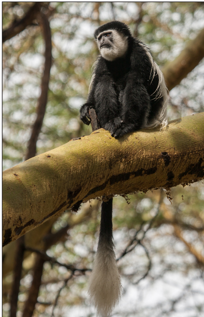
Figure 1. Adult male Mau Forest guereza Colobus guereza matschiei , Lake Naivasha, southwest Kenya. In this subspecies, 36–57% of the tail is white.