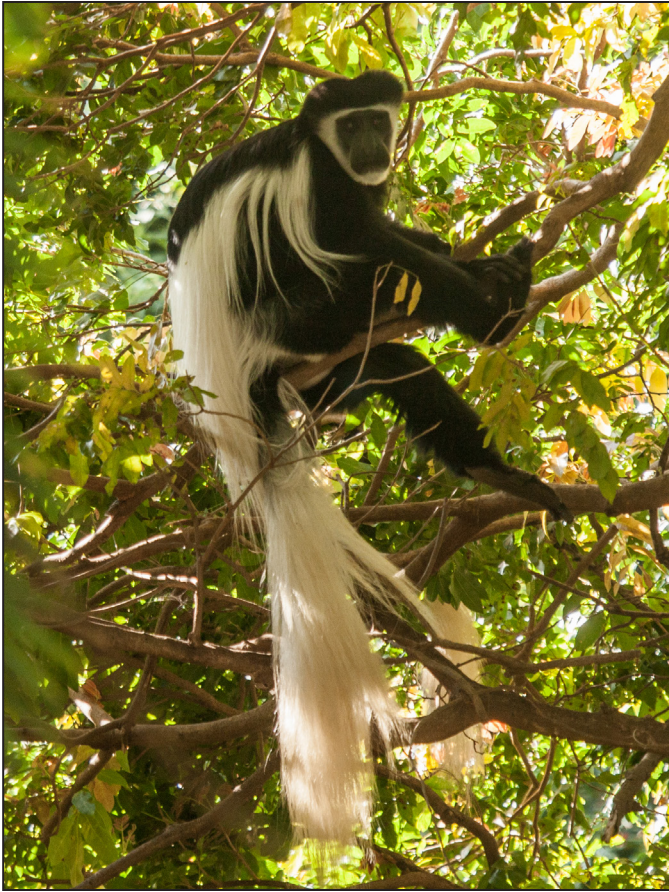
Figure 5. Adult male Mount Kilimanjaro guereza Colobus guereza caudatus , Kitobo Forest Reserve, southeast Kenya.