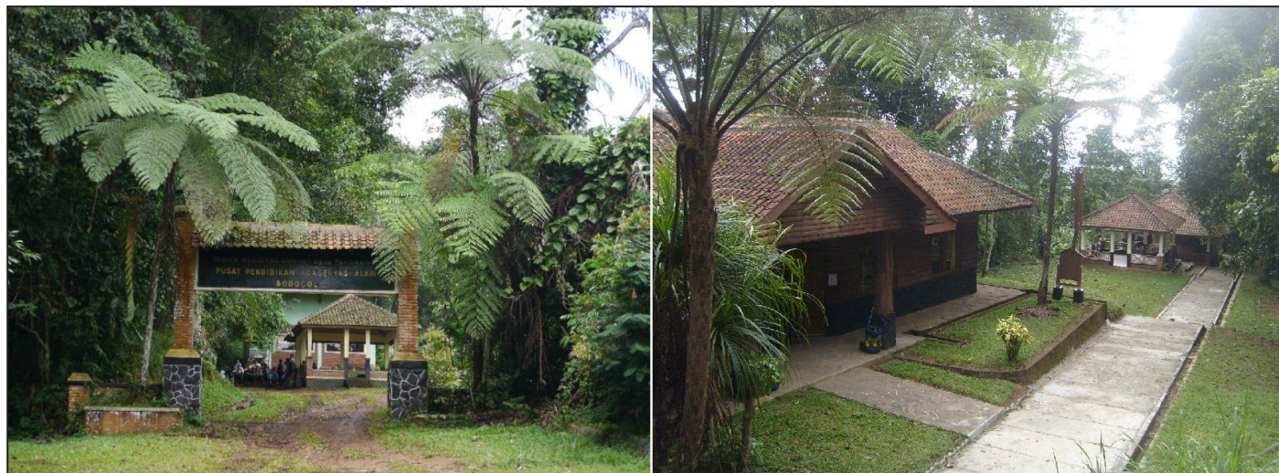
Figures 2 and 3. The Bodogol Conservation Education Center (Photos © Conservation International).