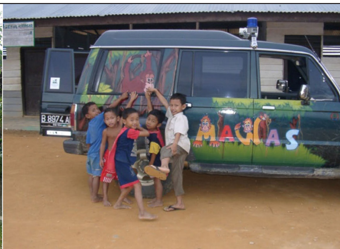
Figures 10 and 11. Vehicles used to visit villages and schools.