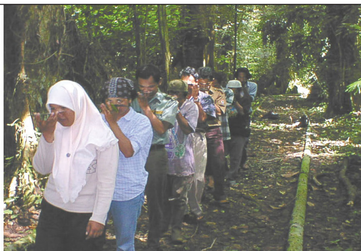
Figures 8 and 9. Activities at the Sibolangit Interpretive Education Center.