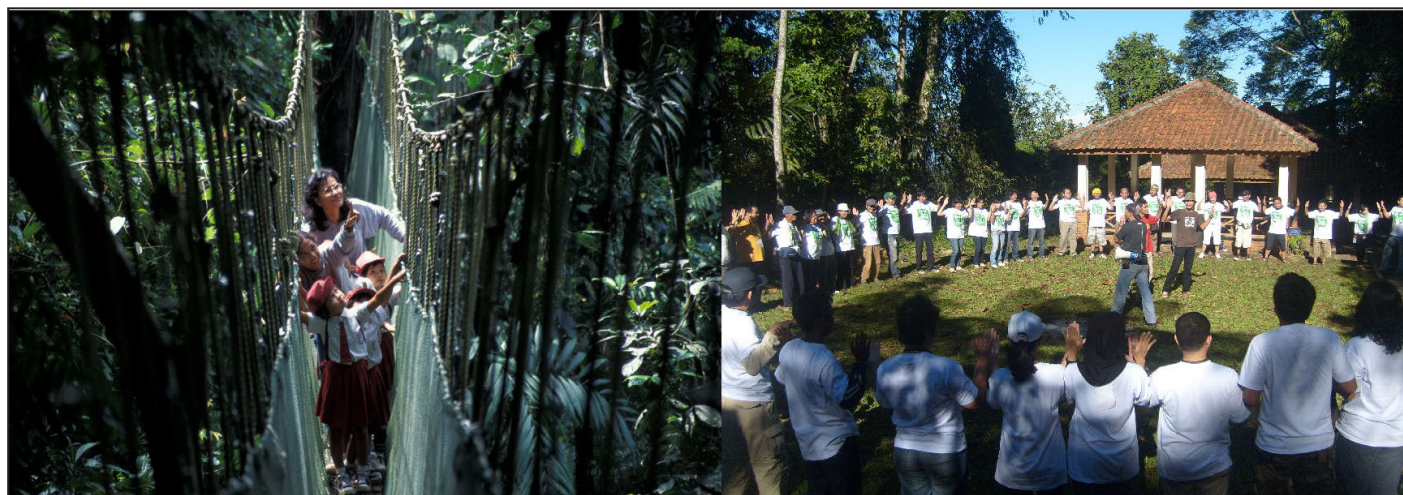
Figures 4 and 5. Activities at the Bodogol Conservation Education Center (Photos © Conservation International).

From 2001–2004, with funding from the Critical Ecosystem Partnership Fund (CEPF) and in partnership with the local office of the Ministry of Forestry, CI developed the Sibolangit Interpretive Center, located approximately a 1-hour drive from Medan toward Berastagi. The Center used the Sumatran orangutan ( Pongo abelii ) as its “flagship” species to increase public awareness about natural resource management and biodiversity conservation (Figs. 8 and 9). The Center was situated on the main road between Medan and Lake Toba in central North Sumatra near a large lake formed by the eruption of a super volcano. It focused on conservation education