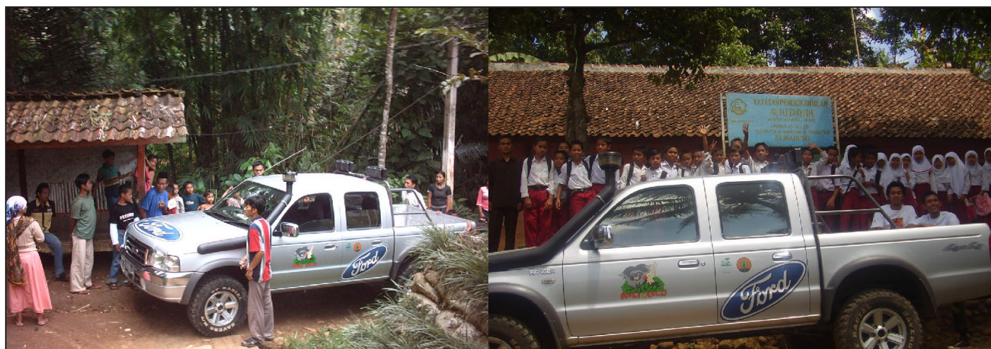
Figures 6 and 7. The vehicle used to visit villages and schools.