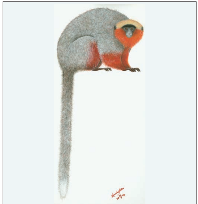
Figure 2. The Madidi titi monkey, Callicebus aureipalatii sp. nov. Illustration by Annika Felton.

Diagnosis: A species of the C. moloch group ( sensu Hershkovitz 1990; Groves 2001) as defined according to broad distributional and physical characteristics. Using the Van Roosmalen et al. (2002) classification, this new species shows physical similarities with the C. cupreus group (crown and cheiridia dominated by pheomelanin hair pigments, orange