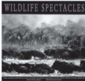
Available in English and Spanish