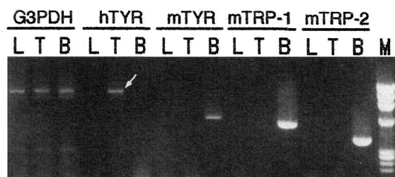
Fig. 1. RT-PCR assay of LHT-2. The positive reference G3PDH mRNA was detected in RNA from L929, LHT-2, and B16 cells. The PCR product of human tyrosinase mRNA (arrow) was only detected in RNA from LHT-2 which was human tyrosinase cDNA-transfected L929. Mouse tyrosinase, TRP-1 and TRP-2 mRNA were detected only in RNA from B16, but no mRNA of these melanogenic genes were detected in RNA from L929 and LHT-2 cells. L, L929 mouse fibroblast. T, LHT-2. B, B16 mouse melanoma. G3PDH, PCR with mouse G3PDH primers. hTYR, PCR with human tyrosinase primers. mTYR, PCR with mouse tyrosinase primers. mTRP-1, PCR with mouse TRP-1 primers. mTRP-2, PCR with mouse TRP-2 primers.

As shown in Table 1, tyrosine hydroxylase, DOPA-