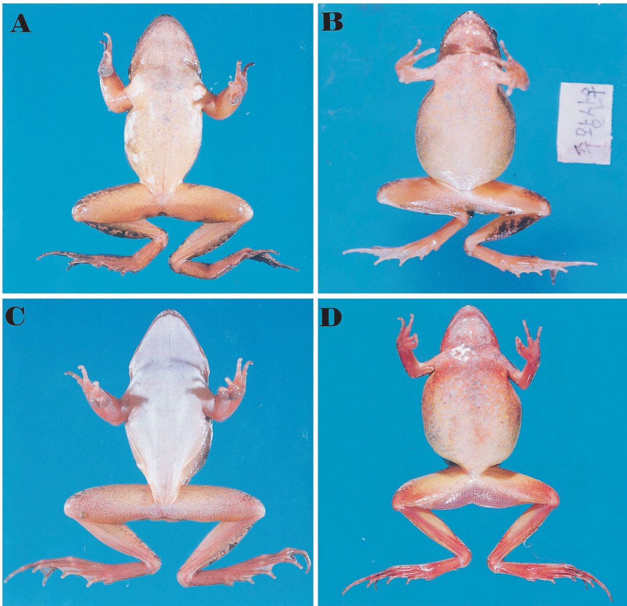
Fig. 2. Ventral views of Rana huanrenensis (A and B) and R. dybowskii (C and D) from South Korea in breeding season showing the grayish-yellow throat and chest of male R. huanrenensis (A) compared to the milky-white throat and chest of male R. dybowskii (C) and the greenish-yellow throat and chest of female R. huanrenensis (B) compared to the reddish-yellow throat and chest of female R. dybowskii (D).

Morphology —Intraspecific morphological variation was much less notable than interspecific one. Rana huanren-