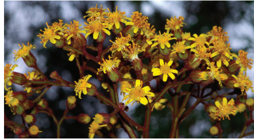
FIG. 3. Roldana gilgii . Tribe: Senecioneae. Known only from the western Guatemalan highlands and Chiapas, Mexico. Plant 0.25 normal size.

In addition to being the most species-rich plant family in the montane regions of Latin America, the Asteraceae represents one of the most conspicuous floral elements (Nash and Williams, 1976; Villaseñor et al. 1998; Strother, 1999; Kessler, 2002). For example, in the Bolivian Andes, the Asteraceae, while found to be distributed at all elevations, has its highest values of species