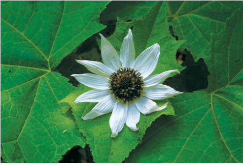
FIG. 2. Rojasiyanthe superba . Tribe: Heliantheae. Known only from three departments in the western Guatemalan highlands and Chiapas, Mexico. Head 0.25 normal size.

Sancho, 2004). Recently, the Asteraceae has been divided into 17 tribes (Bremer, 1994); current phylogenetic evidence suggests that as many as 31 tribes may be recognized (Panero and Funk, 2002). Growth forms within the Asteraceae include annual, biennial, and perennial herbs, vines, shrubs, trees, lianas, and a small number of epiphytes. Pollen evidence indicates that the Asteraceae has a long evolutionary history in Central America with the family showing an explosion in diversity during the Miocene (Raven and Axelrod, 1974). In addition, topography (Kessler, 2002), geographic isolation, and optimal growth conditions led to the evolution of a particularly large number of Asteraceae in the montane regions of Guatemala and Mexico. In Mexico, the Asteraceae has been used as a target group for conservation based on the high number of endemic taxa found in that country, especially in the states of Chiapas and Oaxaca (Villaseñor et al., 1998).