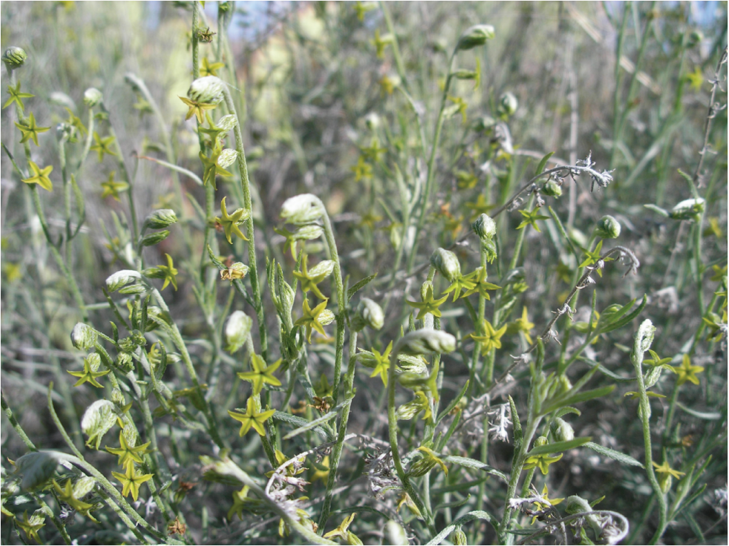
FIG. 3. Heliotropium powelliorum . Terlingua, Texas.

unlike those of H. torreyi , the latter having a heterogeneous array of ascending to erect hairs. I have not been able to detect intergrades between the two taxa among the numerous specimens examined, hence my treatment of these two allopatric entities as good biological species.