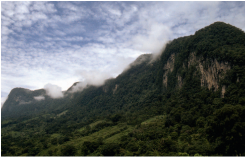
FIG. 3. Study Area 3. View of Cerro Rabón from Jalapa de Díaz where a member of the walnut family is among the dominant trees.

grandiflora , Myriocarpa longipes , and Psychotria fruticetorum .