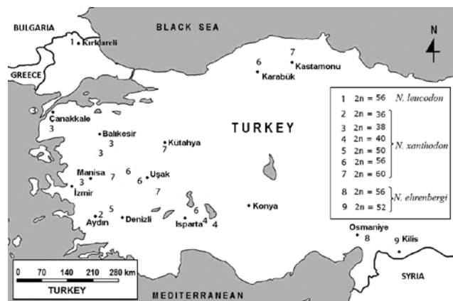
Fig. 1. Sampled sites in Turkey and respective mole rat cytotypes.

We sequenced all 47 samples for a part of the cytochrome b locus. Total genomic DNA was isolated from muscle tissues following the techniques reported by Doyle & Doyle (1987) known as CTAB method. Fragment of the cytochrome b gene was amplified using polymerase chain reaction in 25 \mu\text{l} reaction volume and each reaction included 1 \mu\text{l} of each primer ( 20 \text{ pmol} ) (L14724 and H15154; Irwin et al. 1991,