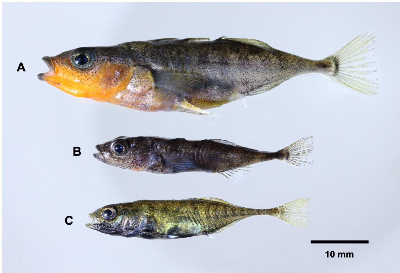
Fig. 1. Colour and morphological differences among sticklebacks on North Uist. A) Sexually mature male three-spined stickleback ( Gasterosteus aculeatus ) expressing typical red nuptial colouration. B) Sexually mature melanic three-spined stickleback. C) Sexually mature nine-spined stickleback ( Pungitius pungitius ).