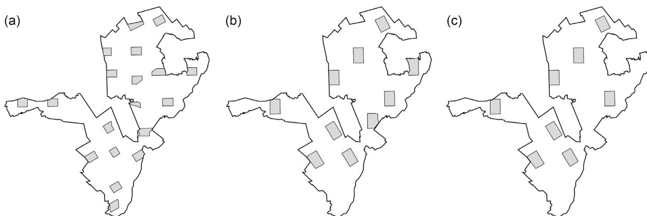
Fig. 2. Distribution of blocks used during ungulate drive counts in the Roztocze National Park in (a) 2003, (b) 2016, and (c) 2017-2020.