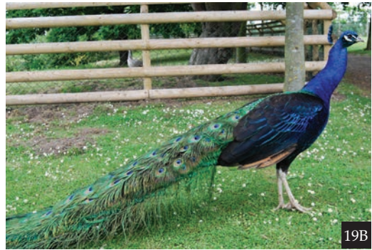
Figure 19. Normal-coloured and black-shouldered male Indian Peafowls Pavo cristatus ; apart from parts of the wing and shoulders, this mutation does not affect the rest of male plumage (Hein van Grouw)