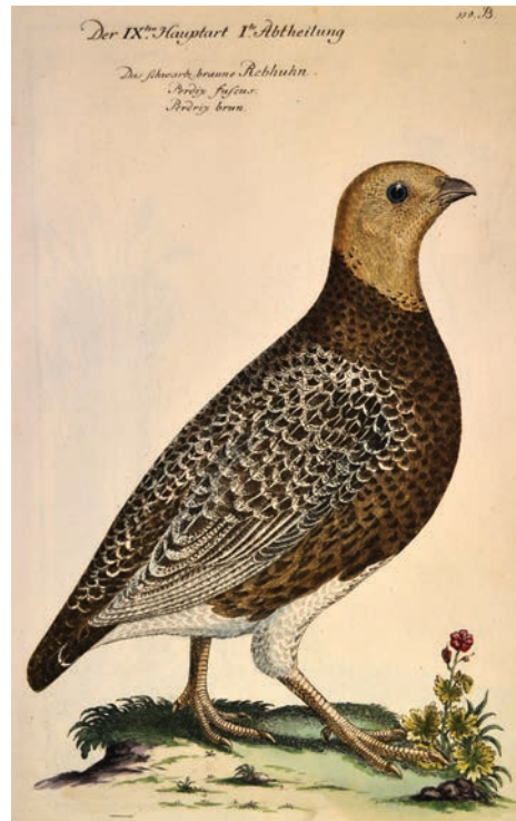
Figure 1. Hand-coloured copper engraving of ‘ Perdix fuscus ’ from Vorstellung der Vögel Deutschlands (1763) by Johann Leonhard Frisch; the same mutation as Brisson’s Perdix montana , i.e. a melanistic Grey Partridge P. perdix (Hein van Grouw, © Natural History Museum, London)

Colour aberrations, especially melanism, have always confused ornithologists. In the past, when nothing was known concerning plumage pigmentation and mutations, aberrant-coloured birds were often viewed as being new taxa, and were even described scientifically. Perhaps the oldest and best-known example of a melanistic aberration named as a new species is Mountain Partridge Perdix montana (Brisson 1760). Brisson knew this ‘species’ only from the mountains of Lotharingen, France, hence montana (of the mountains). It proved, however, that ‘ montana ’ occurred throughout Europe. Frisch (1763) described the same melanistic variety from Germany as ‘Blackish-brown Partridge’ (Schwarz-braune Rebhuhn, see Fig. 1) P. fuscus , and Latham (1823), based on two specimens in Bullock’s museum (1795–1819) that were shot in Cheshire, north-west England, called them Cheshire Partridge. Subsequently, it became apparent that all of these ‘species’ were in fact