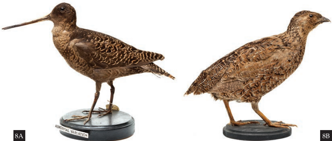
Figure 8A. Melanistic Common Snipe Gallinago gallinago (NHMUK 1939.12.9.3643, Ireland), the same form as was previously described as Sabine's Snipe Scolopax sabinii Vigors, 1825; (B) Melanistic Common Quail Coturnix coturnix (NHMUK 1996.41.442, England, 1895), the same form as was previously described as Verreaux's Quail Synoicus lodoisiae Verreaux & des Murs, 1862