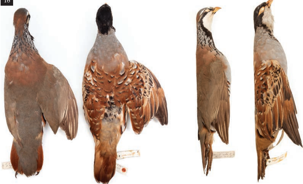
Figure 16. Specimen of Red-legged Partridge Alectoris rufa with a form of melanism that has changed the usual pattern and markings (left, NHMUK 1923.1.29.1) and a normal-coloured individual (right, NHMUK 1907.12.20.7); due to a mutation, the black head and throat markings are altered and the solid-coloured back, shoulders and wing feathers (based mainly on eumelanin) now exhibit distinctive patterns based on both melanin types, and some parts resemble the flanks plumage