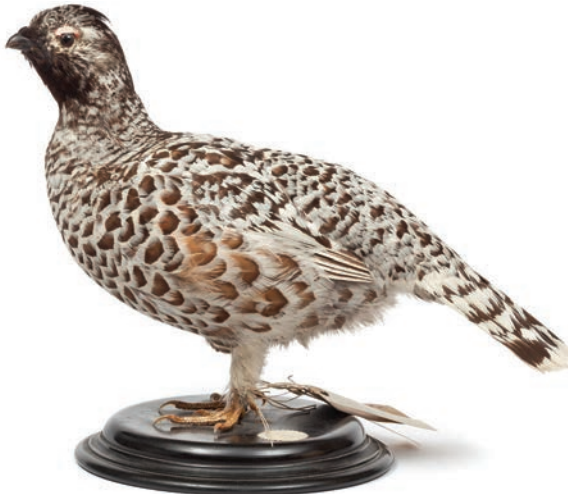
Figure 18. Hazel Grouse Tetrastes bonasia (NHMUK 1987.24.122) with a form of melanism that has altered the typical pattern and markings, resulting in a paler appearance

sexual dimorphism convinced Sclater (1860) to name Black-shouldered Peafowl as a species and not a hybrid or domestic variety: 'I cannot consider it a domesticated variety, because of the differences in both sexes appear to be constant, and to descend to the progeny...'. Similar mutations occur in Mallard Anas platyrhynchos (Fig. 21) and Asian Blue Quail Synoicus chinensis (Fig. 22).