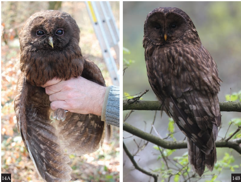
Figure 14A. Melanistic Tawny Owl Strix aluco , Switzerland, April 2015; (B) melanistic morph of Ural Owl Strix uralensis , southern Poland, May 2008

characterised by dense stem cover, and it is suggested that the morphs are associated with perch sites that best conceal them from prey. These examples are certainly not exceptions as will be demonstrated further below.