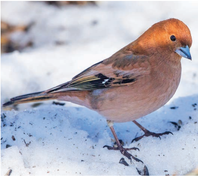
Figure 9. Common Chaffinch Fringilla coelebs , Utö Island, Finland, 13 April 2013, with increased phaeomelanin resulting in predominantly reddish-brown plumage

melanins, Fig. 8) or reddish brown (phaeomelanin, Fig. 9); (2) normally dark markings are bolder and noticeably ‘overrun’ their typical boundaries (the rest of the plumage is often somewhat darker as well, Figs. 10–12); and (3) normal pattern and pigment distribution is changed, but the plumage is not necessarily darker (and can even be paler). See Appendix.