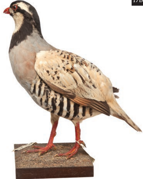
Figure 17. Chukar Alectoris chukar (NHMUK 1939.12.9.3715), same mutation as in Fig. 16.