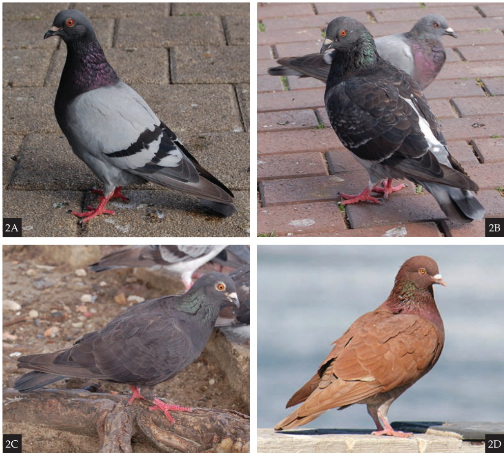
Figure 2. Feral Pigeons Columba livia : (A) wild phenotype, Leiden, the Netherlands, 19 August 2007; the grey wing-coverts and black wingbars are the result of different distribution of the same quantity of black melanin granules (Hein van Grouw); (B) T-pattern chequer, Leiden, the Netherlands, 19 August 2007; as a result of a dominant mutation of the pattern gene, the pigmentation over almost the entire wings is distributed as usually found only in the black wingbars, resulting in a blackish appearance, but the rump, tail and underparts are unaffected (Hein van Grouw); (C) Black, Leiden, the Netherlands, 19 August 2007; due to a dominant mutation known as 'spread', all pigment granules are equally spread, resulting in black plumage throughout (Hein van Grouw); (D) Recessive red, Pismo, California, USA; due to a recessive mutation of the extension gene that inactivates MC1R, pheomelanin alone is produced (Robert Shriner)

of this found in Common Quail Coturnix coturnix (Fig. 5) and Japanese Quail (Hiragaki et al. 2008). The eumelanistic morphs in different isolated populations of Chestnut-bellied Monarch Monarcha castaneiventris on the Solomon Islands are the result of two different mutations. The eumelanistic plumage of birds on the small island of Santa Ana is the result of a variation of the MC1R, while equally black birds on two other small islands, Ugi and Three Sisters, possess a mutation of the agouti gene (Uy et al. 2016).