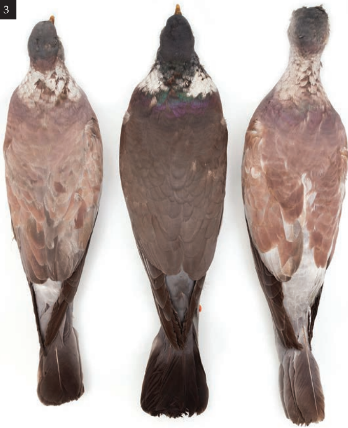
Figure 3. Common Woodpigeon Columba palumbus specimens (NHMUK 1930.8.14.1, NHMUK 2000.11.1, NHMUK 1923.3.8.1); the phaeomelanised plumage is probably the product of a similar mutation as 'recessive red' in Feral Pigeon C. livia (cf. Fig. 2D)