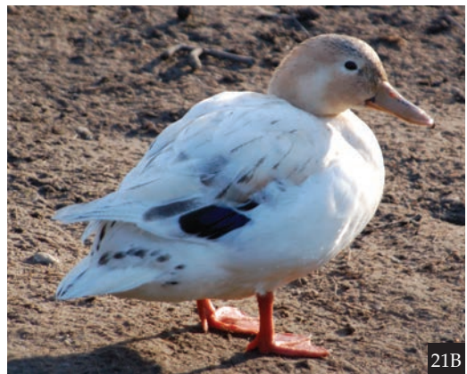
Figure 21. A form of melanism in Mallard Anas platyrhynchos that affects female plumage much more than male plumage (Hein van Grouw)

mentioned nor illustrated one, as otherwise he probably would have realised his mistake (Figs. 25–26). These mutations were not uncommon in Scandinavia and Russia, and in the early 1900s in the Bjerkreim area, Norway, were sufficiently numerous that Schaaning (1921) described them as a new subspecies, Lyrurus tetrix bjerkreimensis (Fig. 27), because '...the plumage of the male is similar to the spring plumage of male Willow Ptarmigan Lagopus lagopus .'