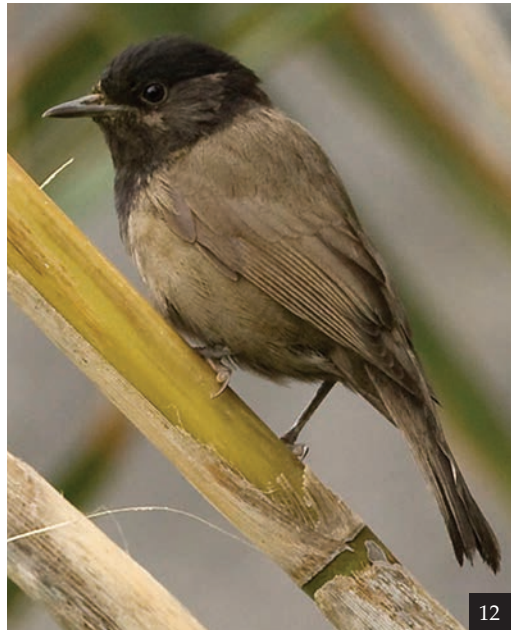
Figure 12. Melanistic morph of Eurasian Blackcap Sylvia atricapilla heineken , Madeira, 27 April 2008; the normal black head markings have overrun their boundaries, whilst the rest of the plumage is darker as well (Hadoram Shirihai)

On most occasions, the confusion was based on melanistic forms that occurred, or still occur, quite commonly in the relevant species / populations. That more individuals were found was, for many ornithologists, evidence that these aberrant birds were indeed distinct species. For example, Menzbier (1896) wrote in his description of Willkowsky's Owl 'At first I thought that this specimen was but a merely individual melanism [ sic ] of Syrnium aluco [Tawny Owl]; but in the spring of this year I received from Mr. Willkowsky a skin of another specimen coloured in the same manner as the first, which had been obtained in a