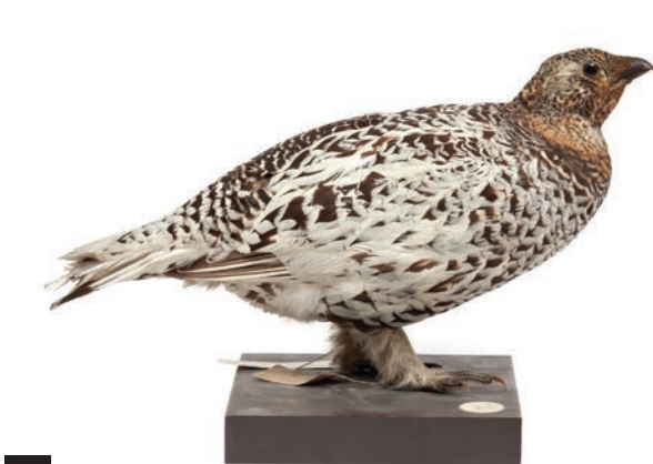
Figure 26. Another form of melanism in Black Grouse Lyrurus tetrix specimens at Zoological Research Museum Alexander Koenig, Bonn, which alters the pattern and markings, resulting in a paler appearance than normal; compare female with right-hand bird in Fig. 24.