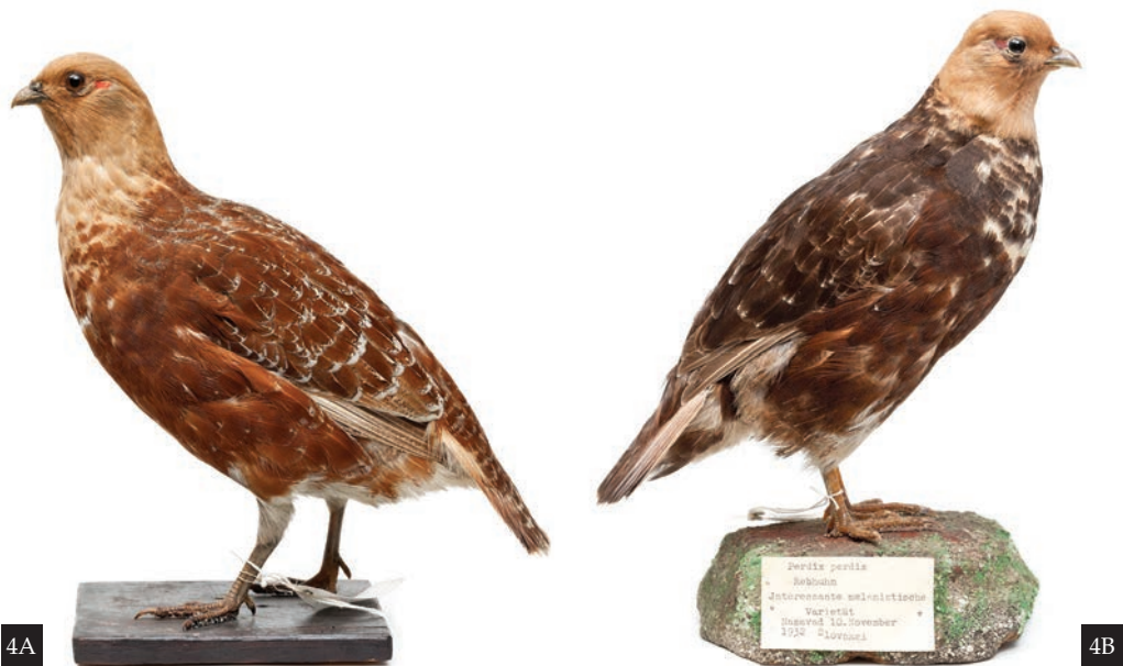
Figure 4. ' Perdix montana ', the phaeomelanistic variety of Grey Partridge P. perdix, NHMUK 1939.12.9.3717, Nasavad, Slovakia, 10 November 1932 (at left) and NHMUK 1939.12.9.3716, Norfolk, England, October 1911; the gene for this recessive mutation is present throughout the range of the species and is therefore a frequently recurring variety on the borderline of being recognised as a morph