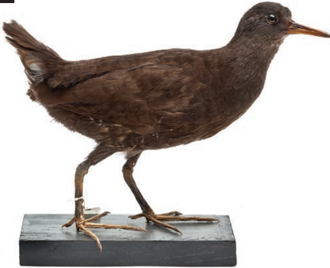
Figure 7. Melanistic Water Rail Rallus aquaticus (NHMUK 1939.12.9.3699, Ireland, 13 November 1902), with increased eumelanin, resulting in almost solid black plumage