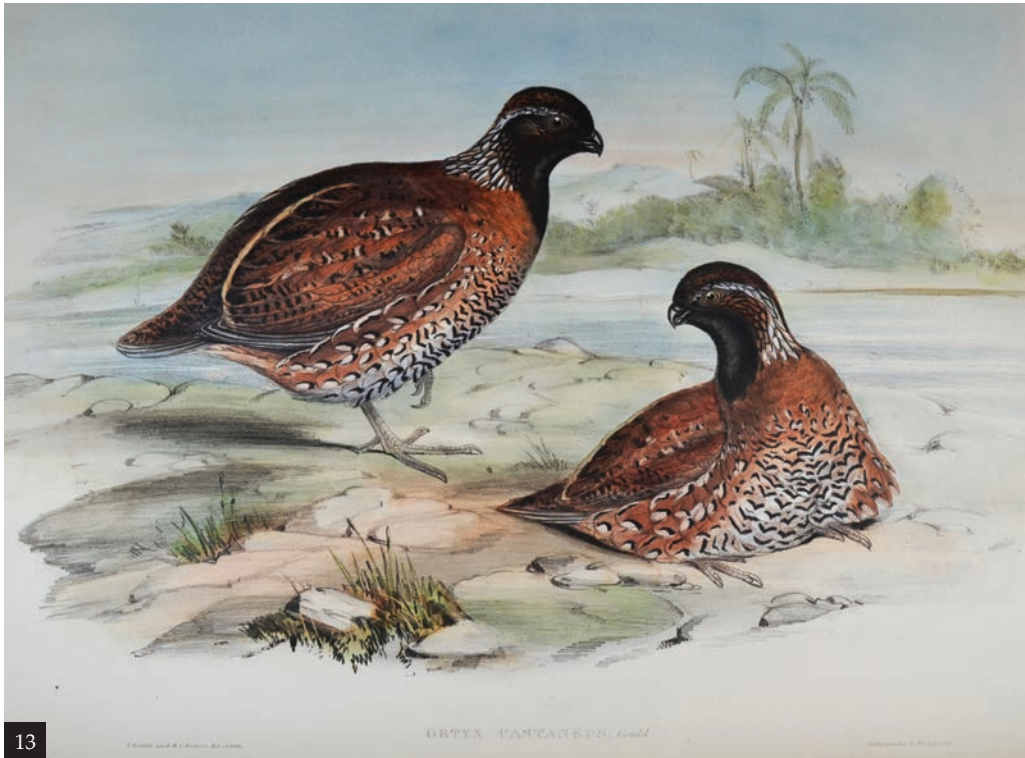
Figure 13. Gould's Chestnut-coloured Partridge Ortyx castanea , which was a melanistic Northern Bobwhite Colinus virginianus ; the normal black head markings have overrun their boundaries, whilst the rest of the plumage is darker as well, the latter mainly due to increased phaeomelanin hence 'Chestnut-coloured'

vineyard in the district of Shushov. After a careful examination of this specimen, I am now convinced that this Owl is a very good new species, differing from Syrnium aluco both in its general colour and character of markings...'. Although rare, melanistic Tawny Owls (Fig. 14A) are still occasionally recorded throughout Europe (and unconnected to the grey and rufous colour morphs of this species). In other Strix species, dark forms are also known and are less uncommon. In Ural Owl S. uralensis (Fig. 14B), for example, the melanistic form is often treated in the literature as a recognised morph.