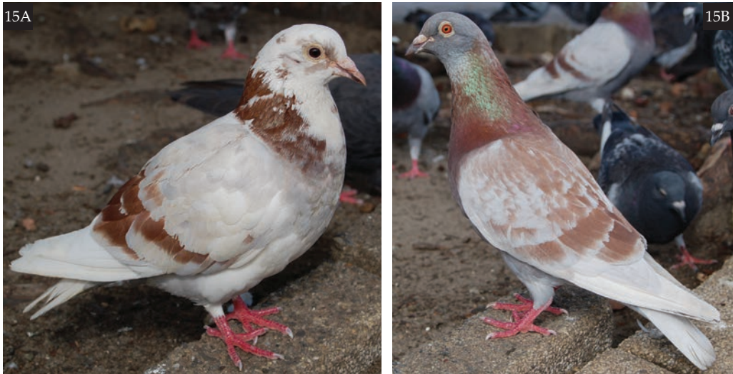
Figure 15. Feral Pigeons Columba livia with phaeomelanised plumage (ash-red) but different wing patterns: (A) Barred (the white primaries and head feathers are the product of leucism), (B) Chequer and (C) T-pattern chequer, Leiden, the Netherlands, 19 August 2007 (Hein van Grouw)

Thus, in some cases, colour morphs of a species may behave differently due to their respective physiological properties. Eventually, colour morphs may evolve into distinct taxa. An example of this is perhaps Carrion Crow vs. Hooded Crow. Besides differences in plumage (melanistic versus non-melanistic), they also differ in vocalisations and habitat selection, the latter especially during the breeding season (Rolando & Laiolo 1994). Nevertheless, in the areas of overlap they do interbreed and, although melanism in crows is probably based on more than one gene, the alleles for black appear dominant (pers. obs., based on colour of first-generation offspring and that of backcrosses to the parental species; Fig 6). Although Carrion Crow and Hooded Crow hybridise, pair composition is not random (Saino & Villa 1992, Rolando 1993, Risch & Andersen 1998). Also, hybrids prefer to breed with 'grey' crows rather than 'black' crows (Rolando & Laiolo 1994), which may suggest that the Hooded phenotype is the original colour. The preference for 'grey' may also explain the non-random pair formation in areas of overlap, if Hooded Crows only select a melanistic partner in the absence of their own phenotype. In general, reproductive success, defined as the number of chicks reared to about fledging, is greater in Carrion Crows than Hooded Crows (Saino & Villa 1992). This may reflect the fact that Carrion Crow is more aggressive (Saino & Scatizzi 1991) and more stress-resistant (Poelstra 2013).