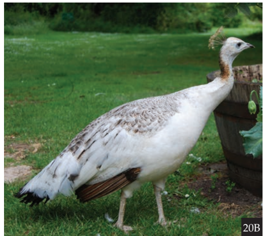
Figure 20. Normal-coloured and black-shouldered female Indian Peafowls Pavo cristatus ; the 'black-shoulder' mutation has a major effect on female plumage