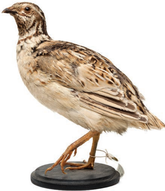
Figure 5. 'Yellow' is a dominant mutation of the agouti gene in Common Quail Coturnix coturnix (NHMUK 1996.41.441, England) resulting in a coloration based on mainly phaeomelanin