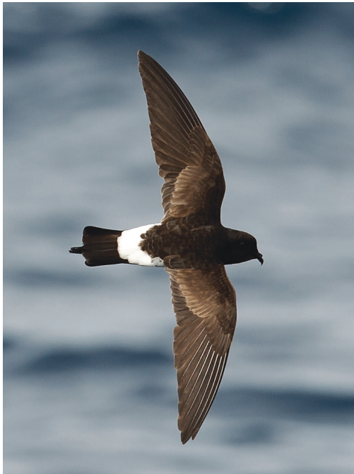
Figure 10 (left). New Zealand Storm Petrel Fregetta maoriana , off North Cape, North Island, New Zealand, 2 March 2013. In dorsal view very similar to Wilson's Storm Petrel Oceanites oceanicus , but the head is Fregetta -like (see main text) and the ulnar bars on the upperwing are subdued.

The Coral Sea / New Caledonian Storm Petrels (Figs. 8–9) can be ruled out because they are larger (using the size of Wilson's Storm Petrel as a guide), with a longer front-end projection, longer tail and broader wings. The Fiji streaked storm petrel is an altogether more compact bird. The Coral Sea / New Caledonian storm petrels consistently exhibit extensive dark markings in the white underwing panels, mainly in the primary-coverts, and heavy streaking on the white belly, including across the central belly, which combine to give a rather dirty appearance to the underparts. Conversely, the underparts of the Fiji streaked storm petrel had a relatively clean appearance, with the underwings less heavily marked and central belly virtually unstreaked.