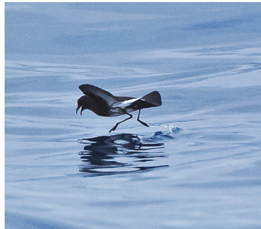
Figures 4–5. New Zealand Storm Petrel Fregetta maoriana , off Gau Island, Fiji, 20 May 2017 (Angus C. Wilson). Dorsal view suggests Wilson's Storm Petrel Oceanites oceanicus but the bird's foot-pattering shown in Fig. 5 is inconsistent with the 'dance' of Wilson's Storm Petrel (Flood & Fisher 2013).

afternoon chumming sessions (Figs. 2–5). Photographs revealed that just one individual was involved. Feather abrasion featured distinctive nicks and notches (Fig. 3). Identification was based on our previous experience of the species and the criteria in Flood (2003) and Stephenson et al. (2008a).