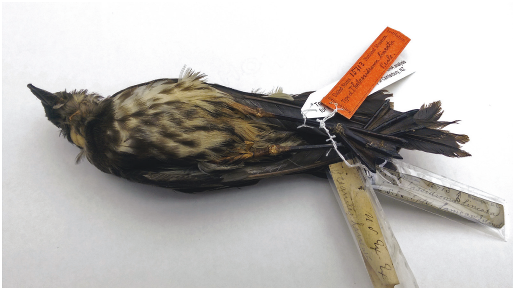
Figure 7. Specimen USNM A15713 (Smithsonian Institution, Washington DC) obtained perhaps October / November 1839, US Exploring Expedition 1838–42, Upolu, Samoa (Brian K. Schmidt). Considered to be a Black-bellied Storm Petrel Fregetta tropica (Murphy & Snyder 1952, Gill et al. 2010). Note heavy streaking across underparts, including the central belly; outer and middle toes of comparable length.

The following recent developments cast further light on the streaked storm petrel conundrum. On 7 April 2008, a single (or two) streaked storm petrel was photographed off southern New Caledonia during a Western Pacific Odyssey expedition cruise, operated by Heritage Expeditions (RLF was an observer). Howell & Collins (2008) made the reasonable suggestion, at the time, that it was possibly a New Zealand Storm Petrel. However, given further sightings in subsequent years, in the same region, it is apparent that these birds—now labelled 'New Caledonian Storm Petrel'—are not New Zealand Storm Petrel (Collins 2013). In 2013 and again in 2014, separate teams led by C. Collins and P. Harrison tried to