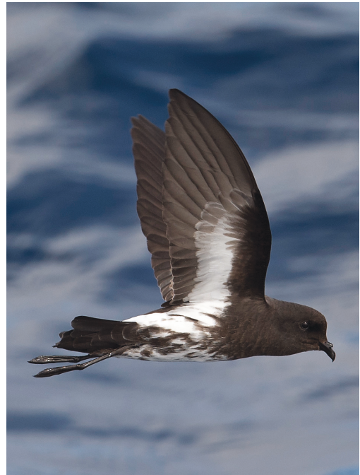
Figure 11 (right). New Zealand Storm Petrel Fregetta maoriana , Hauraki Gulf, North Island, New Zealand, 1 February 2017. Greyish underside to greater primary-coverts becomes progressively paler towards innermost feathers; dark fingers in median primary-coverts protrude into white underwing panel.