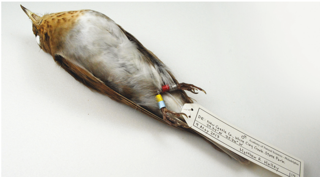
Figure 7. ANSP 204310, the neotype of Turdus mustelinus Wilson (= Catharus f. fuscescens ), see text for detail of the specimen's provenance (Matthew R. Halley)

Art. 72.7 of the Code (ICZN 1999). It is not, however, unambiguously identifiable because none of its type material is extant or traceable, and the attributes described in the original description of T. mustelinus Wilson are shared by more than one species. To fix the taxonomic identity of Turdus fuscescens Stephens, 1817, so that traditional nomenclature is maintained and to prevent destabilising confusion arising from alternative identifications, I hereby designate as its neotype ANSP 204310, a colour-banded male deposited in the collection of the Academy of Natural Sciences of Drexel University, Philadelphia. This action fulfills the requirements for neotype designation in the Code (ICZN 1999) by: clarifying the taxonomic application (status) of the name, as explained above (Art. 75.3.1), describing, illustrating and referencing the defining characters of Veery and its neotype (Art. 35.3.2), providing data sufficient to ensure recognition of the specimen designated (Art. 75.3.3), providing grounds for believing that all original type material has been lost and is untraceable (Art. 75.3.4), showing that traits of the neotype are included in the original description (Art. 75.3.5), choosing the neotype from a locality in the same physiographic province (second-growth Mid-Atlantic Piedmont forest) where Wilson collected some of his type material (Art. 75.3.6), and recording that the neotype is preserved as the property of a recognised scientific institution (Art. 75.3.7).