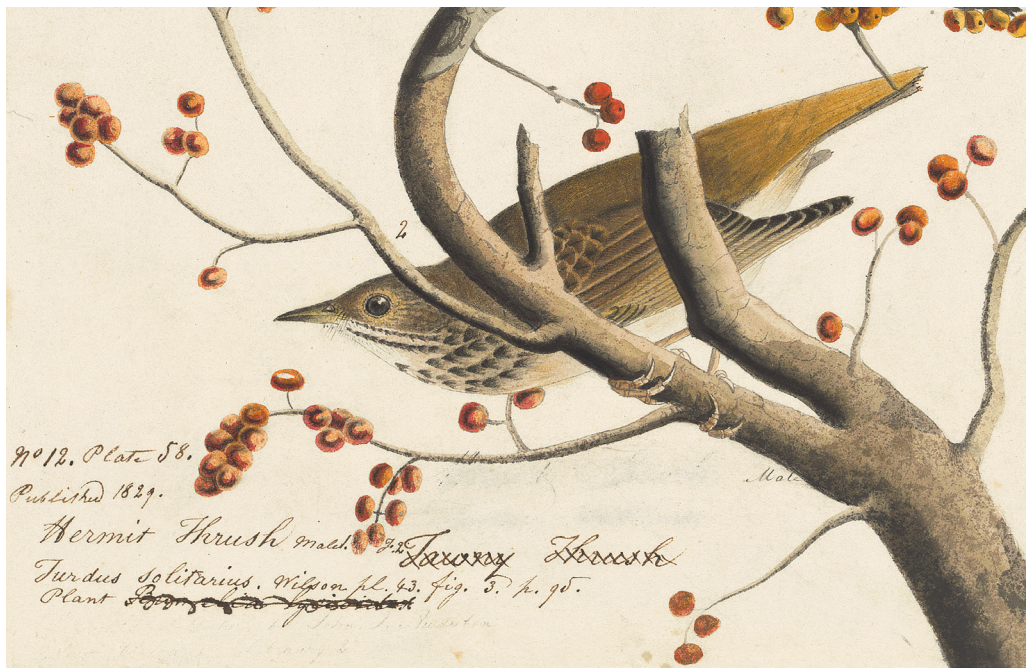
Figure 6. Cropped image of Audubon's original painting of Hermit Thrush T. solitarius (= Catharus guttatus faxoni), showing his mistaken identification ('Tawny Thrush,' crossed out). The painting was executed with watercolour, graphite, pastel, black ink and gouache on paper, laid on card (N-YHS no. 1863.17.58). The inscription in the lower left reads: 'No 12. Plate 58. / Published 1829. / Hermit Thrush Male 1. F. 2. Tawny Thrush [crossed out] / Turdus solitarius. Wilson pl. 43. fig. 3. p. 95. / Plant Bromelia lycis... [crossed out]'. The painting was signed below in graphite: 'John. J. Audubon.'

as Audubon claimed. But the breeding range of Hermit Thrush extends all the way to far eastern Labrador, matching Audubon's description of Tawny Thrush range. This discrepancy supports the hypothesis that when Audubon heard Hermit Thrushes ( C. g. faxoni ) sing in the distance, he incorrectly identified them as Tawny Thrushes; recall, he thought Hermit Thrush was mute (Audubon 1831: 303). Audubon's original painting of Hermit Thrush (N-YHS no. 1863.17.58) provides further evidence that he confused these species: below the image, Audubon initially labelled his illustration 'Tawny Thrush,' but sometime later crossed it out and wrote 'Hermit Thrush' (Fig. 6).