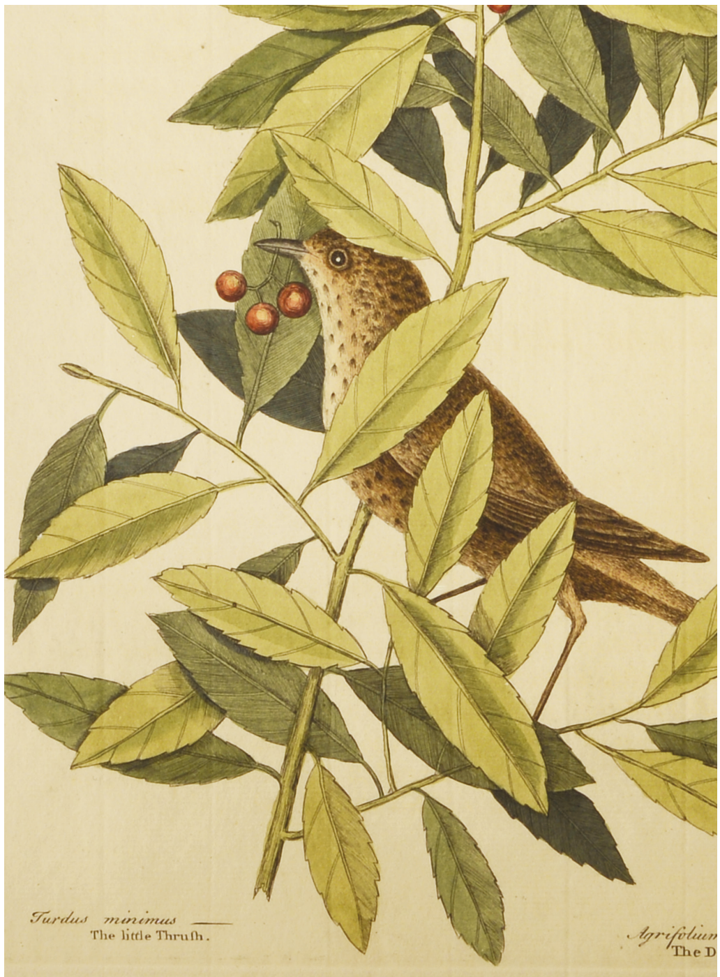
Figure 1. Cropped image of Little Thrush from Pl. 31 of Catesby (1731), probably illustrated without reference to a specimen (see text). Image reproduced courtesy of the Library of the Academy of Natural Sciences of Drexel University (QH41.C35).