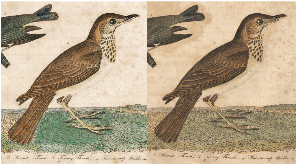
Figure 4. Comparison of cropped images of Tawny Thrush T. mustelinus Wilson, in two different original pressings of American ornithology , vol. 5, Pl. 43 (1812). The image on left is from Bartram's personal copy, given to him by Wilson and now stored in the library at Bartram's Garden in Philadelphia. It is noticeably dirtier than other plates from the same volume (J. Fry pers. comm.). The image on right, reproduced from a copy of uncertain provenance in the Library of the Academy of Natural Sciences of Drexel University (QL681. W732), is even more discoloured.

(Fig. 4). However, neither the plates, nor the unpublished watercolour and pencil drawing that served as their basis (see Burt & Davis 2013 for a reproduction), bring clarity to the problem that dorsal coloration is shared by more than one species.