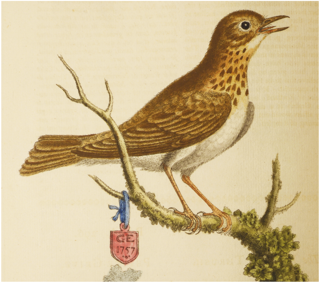
Figure 2. Cropped image of Little Thrush from Pl. 296 of Edwards (1760), depicting the specimen collected in 1756 by William Bartram (see text). A medallion in the illustration bears the initials 'GE' (George Edwards) and the year 1757, indicating that the image was drawn from a fresh specimen, not more than one year old.