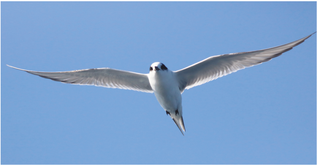
Figure 6. One of a group of Arctic Terns Sterna paradisaea , north of Inhaca Island, Mozambique, 23 July 2017; note uniform-aged primaries unlike in the non-breeding (presumed first-year) Common Terns S. hirundo seen the same day

Tanzania (Zimmerman et al. 1996, Stevenson & Fanshawe 2002) or the Malagasy region (Safford & Hawkins 2013).