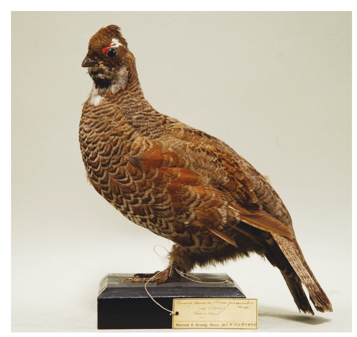
Figure 16. Melanistic specimen of Hazel Grouse Tetrastes bonasia formerly known as T. gryseiventris, in the Zoological Research Museum Alexander Koenig, Bonn