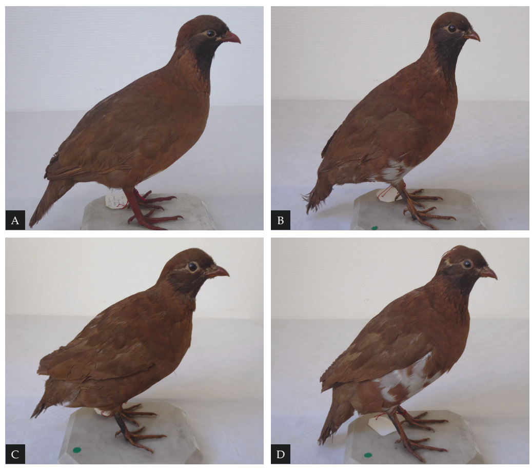
Figure 7. Mounted specimens at Museum de Société des Sciences Lettres et Arts de Cholet et sa région, France. A: SLA274-37.2. B: SLA288-37.6. C: SLA266-37.7. D: SLA265-37.8