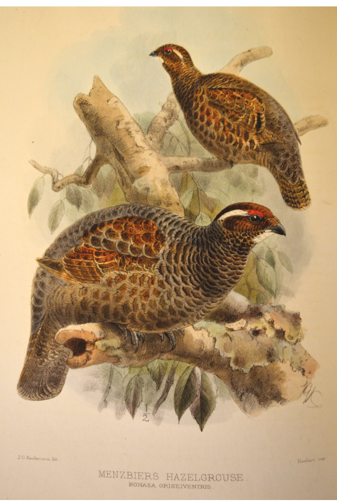
Figure 15. Menzbier's Hazel Grouse Bonasa griseiventris [sic], in Dresser (1896), proved to be a melanistic variety of Hazel Grouse Tetrastes bonasia; the specimen Dresser selected for the illustration had a small white bib and a few white feathers behind the eye, features which he assumed distinguished the 'species'. However, a few white feathers often co-occur with certain forms of melanism, but are certainly not usual