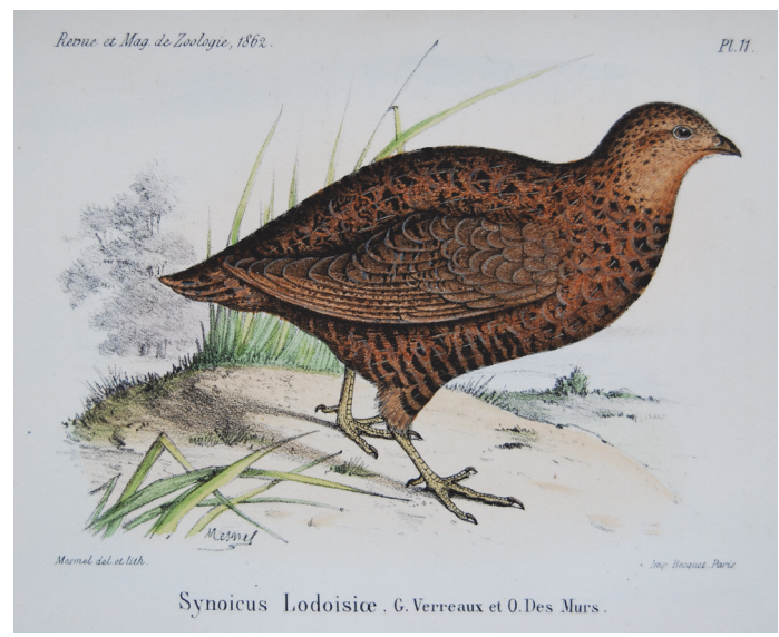
Figure 14. Synoicus Iodoisiae, in Verreaux & des Murs (1862), which proved to be a melanistic variety of Common Quail Coturnix coturnix (Hein van Grouw, © Natural History Museum, Tring)