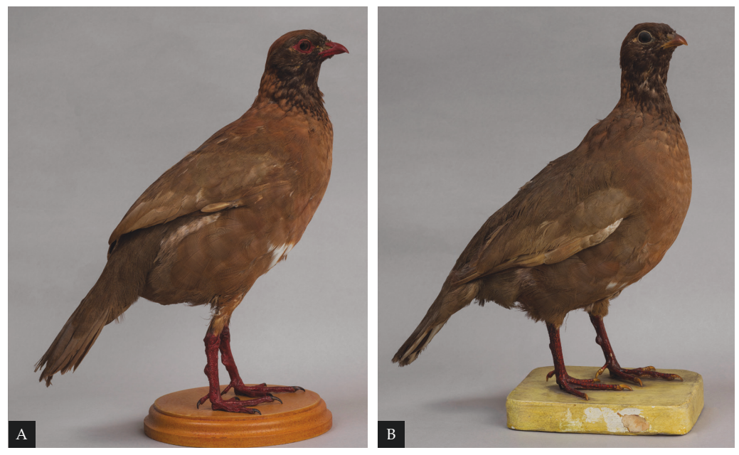
Figure 6. Mounted specimens at Muséum des sciences naturelles d'Angers, France. A: MHN.An.2003.522. B: MHN.An.2003.523

'Perdrix lugubres, achetée 10 francs' It is unclear whether 1863 is the date of acquisition, collection or registration. 1863, however, appears to be incorrect for collection or acquisition as, based on de Soland (1861), these specimens must have been present in the museum