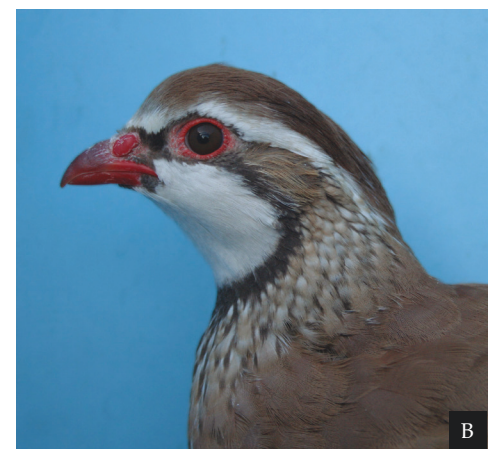
Figure 19. 'Brown' Red-legged Partridge Alectoris rufa, bred and held in captivity

which certainly contributed to their extirpation. Whether the mutation also had negative effects on fitness meaning that a thriving population would never have become established is unknown. Many mutations, however, like 'Leucism', 'Dilution' and 'Brown' (Figs. 17–19), in Red-legged Partridge are widespread in populations and appear repeatedly in the wild. In contrast, the melanistic variety is known only from three localities and for a period of c.70 years prior to 1915. A possible explanation for the loss of the melanistic variety is that the allele for this mutation has disappeared altogether from Red-legged Partridge populations due to hunting and an influx of genetically unrelated birds.