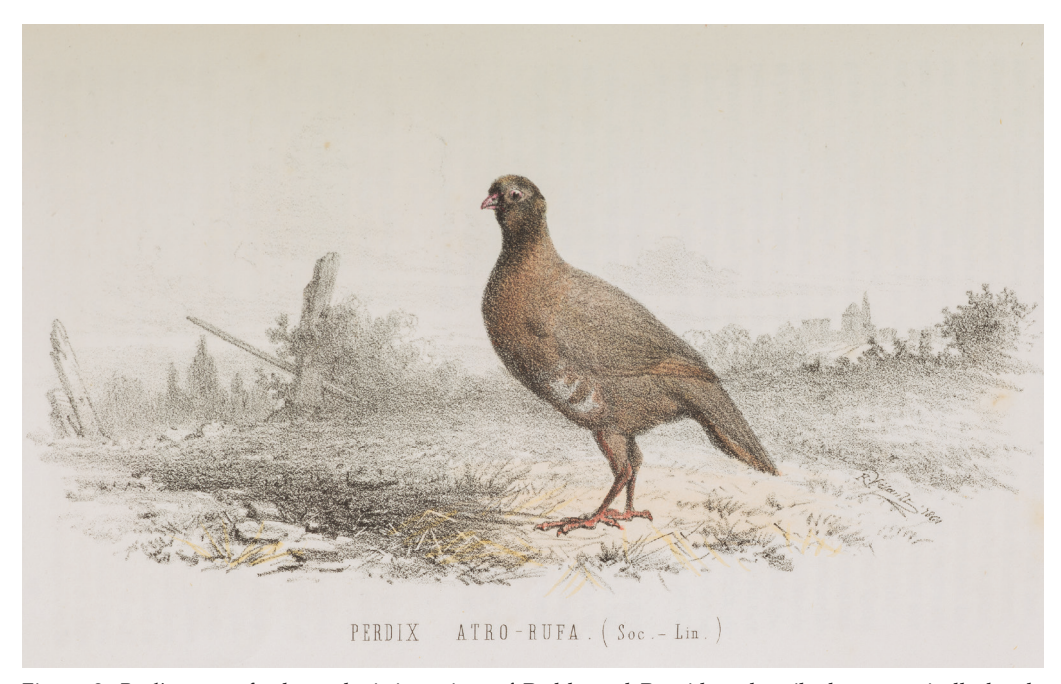
Figure 2. Perdix atro-rufa, the melanistic variety of Red-legged Partridge, described taxonomically by de Soland