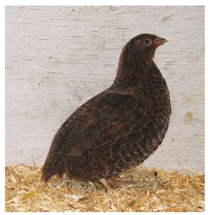
Figure 13. Melanistic form of Japanese Quail Coturnix japonica known as 'recessive black'. Both melanin pigments seem to be equally present in most feathers and the original patterns and markings are faint and therefore this mutation is very much comparable with the melanistic variety known as atro-rufa in Redlegged Partridge Alectoris rufa

japonica , as in the latter, due to the mutation, each feather also contains both pigments and the original patterns and markings are faded (Fig. 13). In appearance, the varieties of both species do not look like each other at all, but in their normal colour the two are also totally different. In comparing mutations within different species, one must examine what happens to the pigmentation process, rather than just comparing the final result, as this can differ between species.