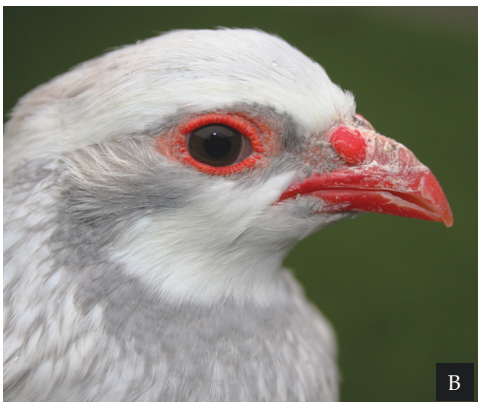
Figure 18. 'Diluted' Red-legged Partridge Alectoris rufa, bred and held in captivity