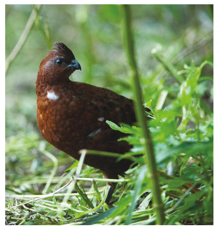
Figure 12. Melanistic form of Northern Bobwhite Colinus virginianus known as 'Tennessee Red'; note the few white feathers (leucism) which often co-occur with certain forms of melanism; see Figs. 10 and 15