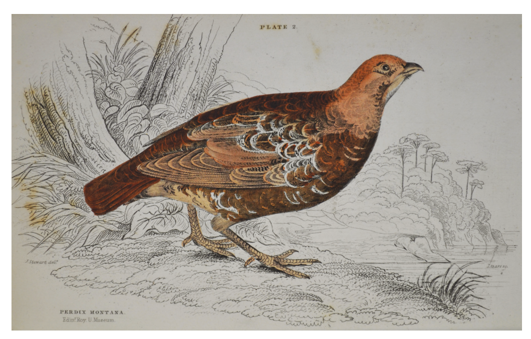
Figure 1. Mountain Partridge Perdix montana. Brisson knew this 'species' only from the mountains of Lotharingen, France, hence montana. However, subsequently 'montana' was proven to occur all over Europe and to be a melanistic form of Grey Partridge P. perdix. From Sir William Jardine's Naturalist's library, 1834, The natural history of game birds (Hein van Grouw, © Natural History Museum, London)