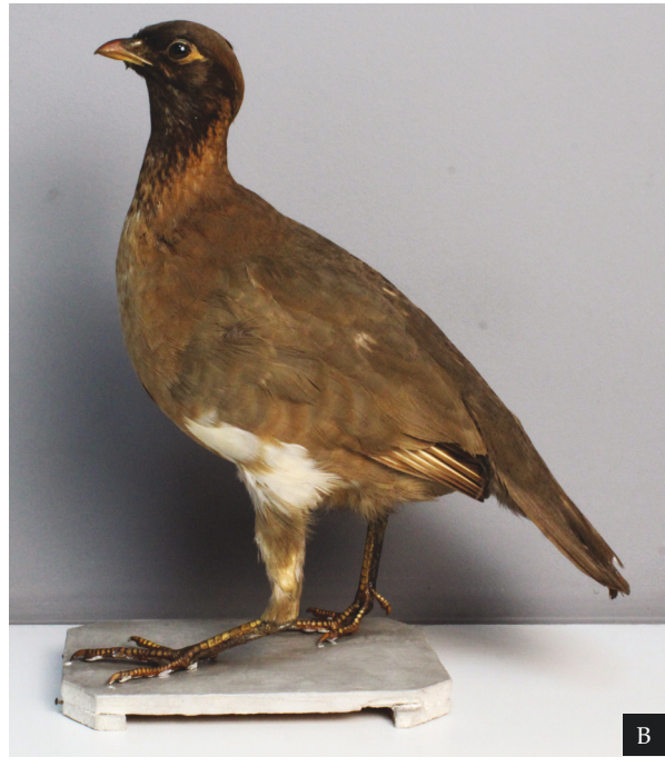
Figure 4. Mounted specimen (MHNM.0.394) at Muséum d'Histoire naturelle de Marseille, originally labelled 'Basses Alpes, France 1844'. A: figured in Hachisuka (1928) (Hein van Grouw). B: photographed in 2016 (Stéphane Jouve, ©Muséum de Marseille)

female, but no evidence of the bird's sex is recorded with the specimen. Until April 1970, 'Basses-Alpes' was the name of the Alpes-de-Haute-Provence, in southern France. If the date and locality are correct, then this specimen was collected before the population in Vendée was discovered, and is probably unrelated genetically.