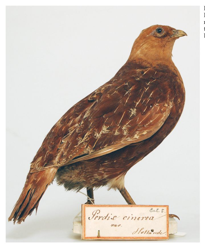
Figure 11. Melanistic form of Grey Partridge Perdix perdix, originally named P. montana, a specimen in the Naturalis Biodiversity Centre, Leiden