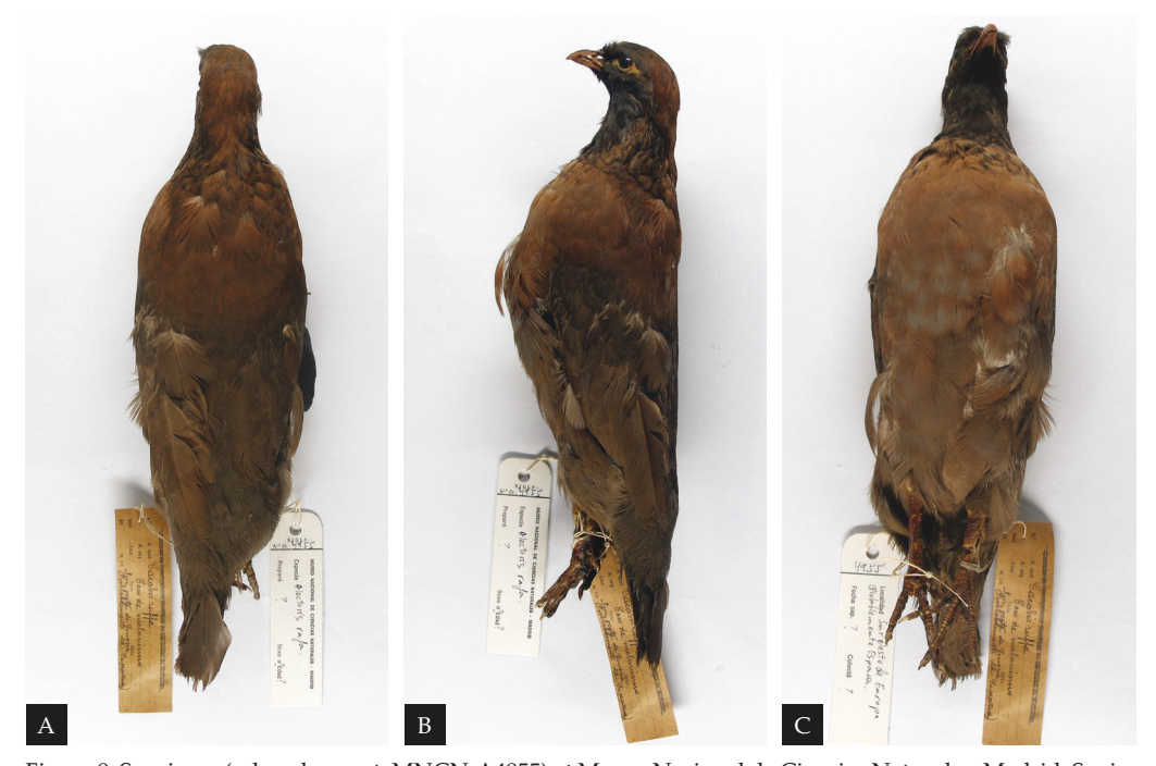
Figure 9. Specimen (relaxed mount, MNCN-A4955) at Museo Nacional de Ciencias Naturales, Madrid, Spain, labelled 'Sur-oeste de Europa, probablemente España'