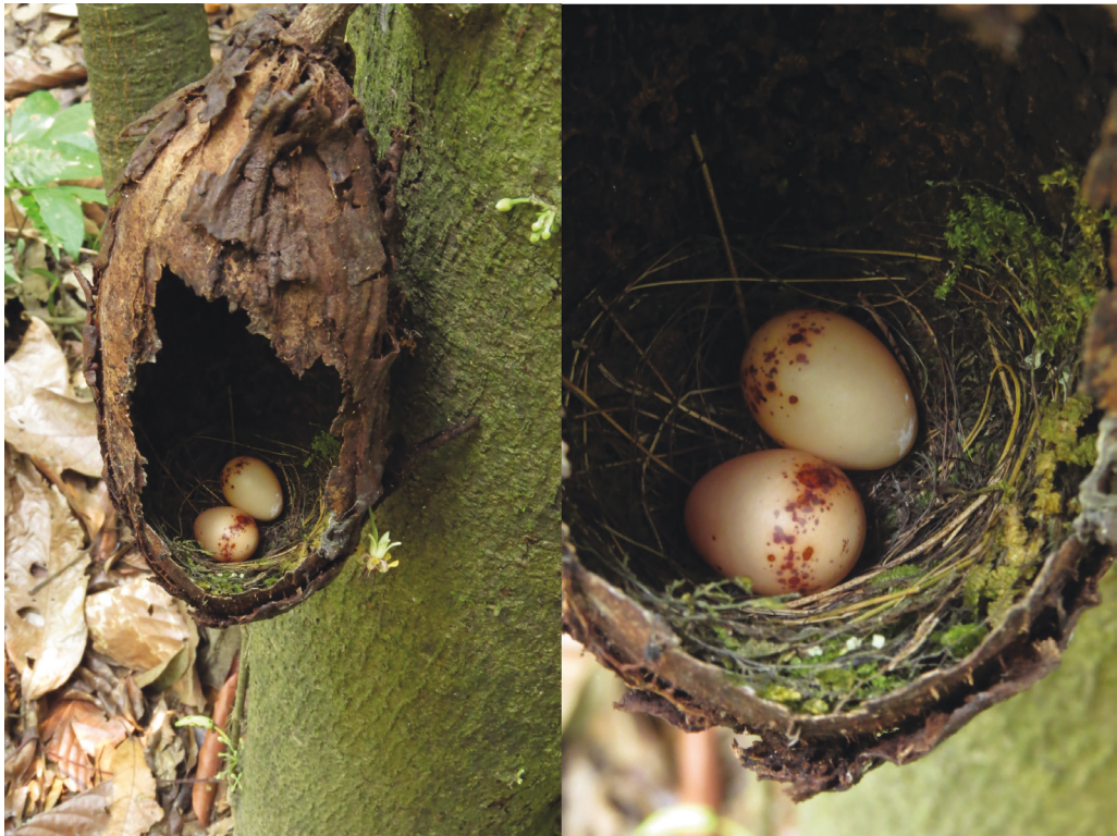
Figure 6. Nest and eggs of Euler's Flycatcher Lathrotriccus euleri in a dried cocoa Theobroma cacao fruit (Malvaceae), Rondônia, Brazil, September 2017

and south-east of its range is well known (Di Giacomo & López Lanús 1998, Aguilar et al. 1999, Marini et al. 2007, Auer & Bassar 2009). There, nests are shallow cups constructed in natural cavities in trees, fallen logs or in ravines, with a mean height above ground of 2 m. The clutch is two or three eggs.