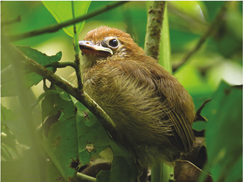
Figure 2. Plain-winged Antshrike Thamnophilus schistaceus fledgling, Rondônia, Brazil, June 2018

shape, composition, height and attachment were similar to those of a nest of the species found in June 2016, in Mato Grosso state, Brazil (C. P. Figueiredo; https://www.wikiaves.com/1234488 ). The elongated leaf of Costus sp. used here, offered a similar substrate to the leaves of understorey palms, which are among the most frequently used nest substrates of the genus Phaethornis (Ruschi 1949, Oniki 1970, Greeney et al. 2018).