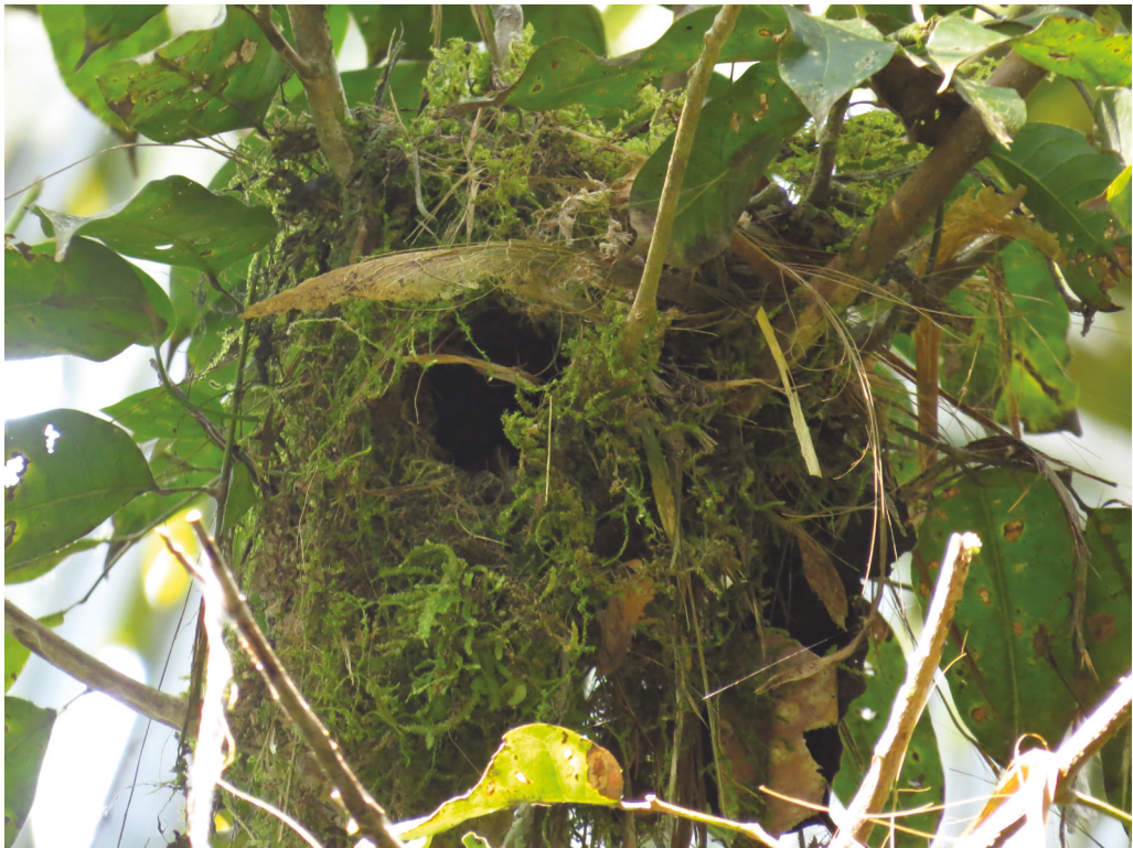
Figure 4. Nest of Specked Spinetail Cranioleuca gutturata in floodplain várzea forest, Rondônia, Brazil, June 2018 (Tomaz Nascimento de Melo)

On 15 June 2018 a nest under construction was found in a lowland forest, c. 200 m from the Phaethornis hispidus nest described above. An adult was observed collecting green mosses in a nearby tree and depositing the material in the nest, which was a globular closed construction c. 200 mm tall, of dry leaves and green mosses, especially the latter (Fig. 4), with a lateral entrance. The nest was sited on the fork of a branch of Protium sp. (Burseraceae), c. 7 m above ground. On returning to the site on 10 July, the nest was apparently empty and no adult was observed. It is unknown whether the nest had been abandoned or not. There are very few published data concerning the species' breeding biology: Remsen (2003) mentioned nestbuilding in mid August in Peru, and the nest reported here was obviously similar to that described previously. A nest found in January, also in Brazil, was of similar shape and size, but with less green moss used in the construction (D. P. Fernandes; https://www.wikiaves.com/1234488 ).