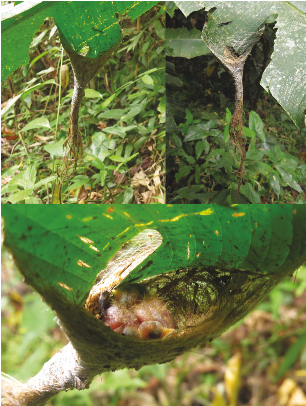
Figure 1. White-bearded Hermit Phaethornis hispidus nest with two nestlings, Rondônia, Brazil, June 2018

was sited 1.01 m above ground in a Costus (Costaceae) plant (Fig. 1). The cup measured 31 × 52 mm internally, and was 130 mm tall externally, with an elongated 'tail' of 70 mm at the base of the cup. The nest comprised fine, pale, dry palm fibres, tightly bound with spider webs, and attached to the underside of a damaged strip of leaf. Overall, the nest's