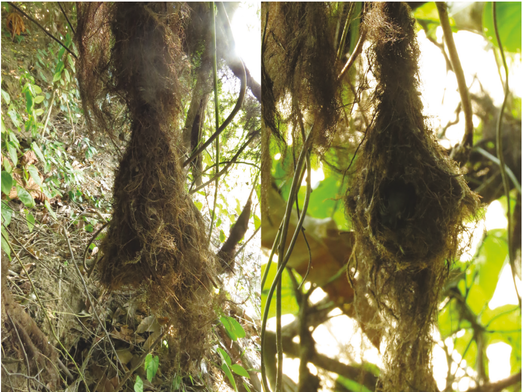
Figure 5. Nest of Spotted Tody-Flycatcher Todirostrum maculatum constructed on the root of a Capsiandra sp. (Fabaceae) near the Madeira River, Rondônia, Brazil, July 2018 (Tomaz Nascimento de Melo)