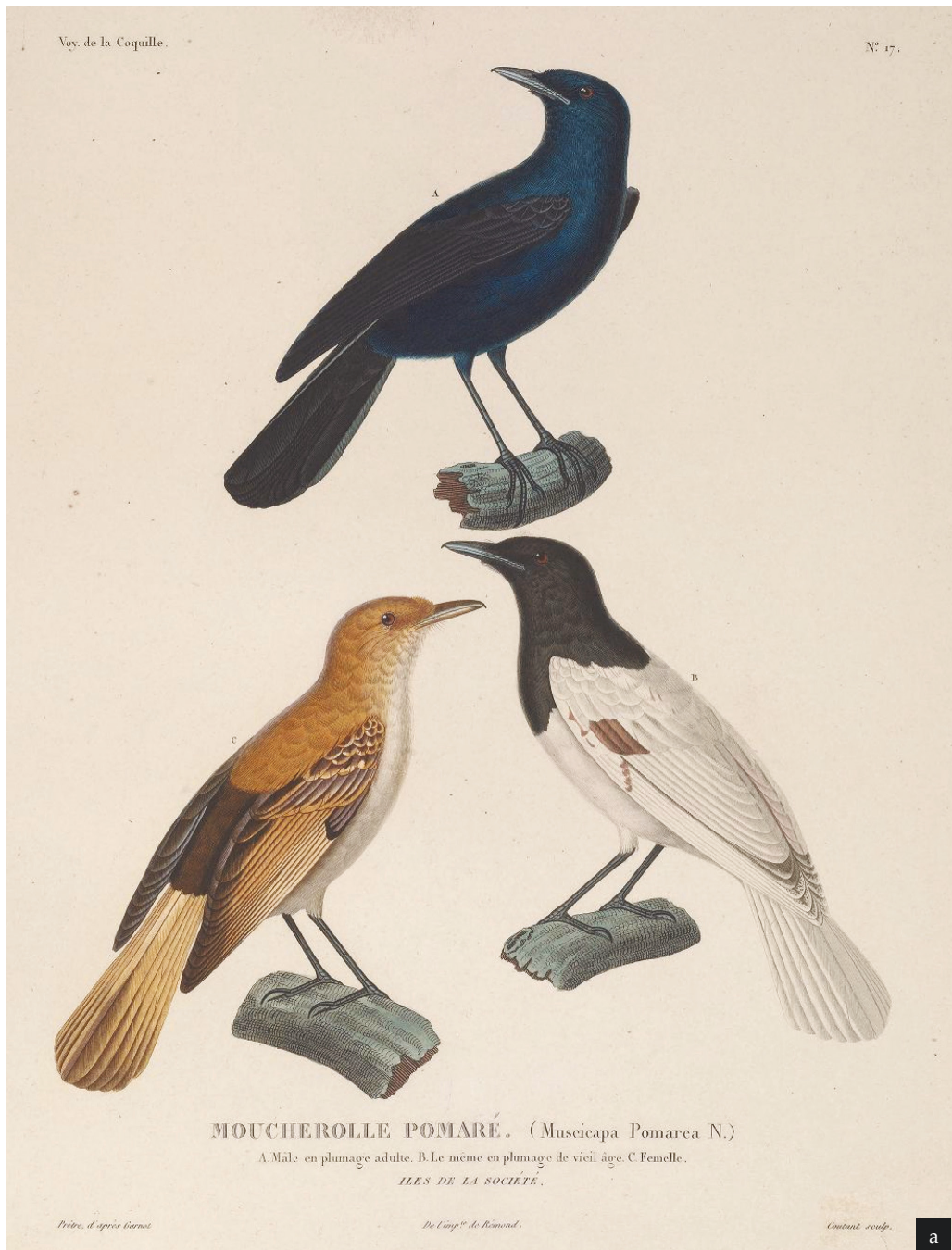
Figure 2a. Pl. 17 from the Voyage de la Coquille : A (top) said to be of a male and from Tahiti; image B (lower right) said to be an old male, from Maupiti; image C (lower left) said to be a female.