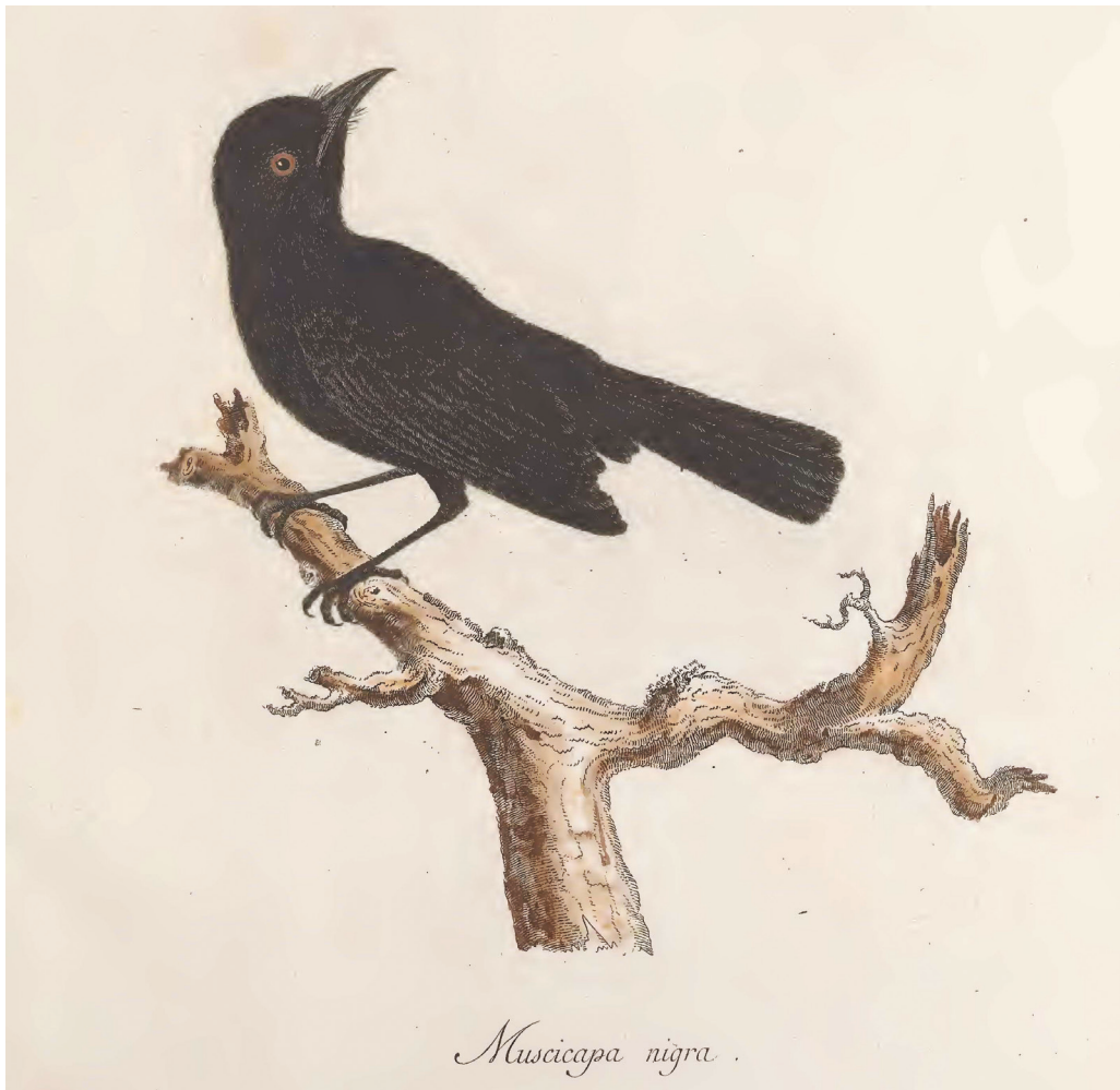
Figure 1. Pl. 23 from Sparrman's Museum Carlsonianum , Fasc. 1, 1786. Anders Sparrman (1748–1820), a Swede, joined James Cook's second voyage in Cape Town in late 1772, and returned there in 1775. Tahiti was visited on 16 August to 17 September 1773, and 22 April to 4 June 1774.