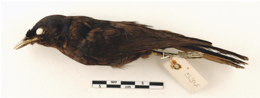
Figure 5. Surviving 'male' syntype (MNHN-ZO-2016-276) of Muscivora pomarea Lesson & Garnot, 1828 (also a syntype of Muscivora maupitiensis Garnot, 1829, although not representative of the Maupiti population). Originally catalogued as no. 9458B, and typical of the subject of image A in Pl. 17 of the Voyage de la Coquille

Combining the evidence of Lesson that pomarea is a synonym of nigra —a view shared by Garnot—with what we know of de Blosseville and the island of Maupiti, it is clear that Garnot's final sentence sought to indicate that the bird collected by de Blosseville was from Maupiti. We therefore designate the specimen depicted in fig. B of Pl. 17 as the lectotype of Muscivora maupitiensis Garnot, 1829. This specimen is also a syntype of Muscivora pomarea Lesson & Garnot, 1827, but it must not be considered representative of that taxon.