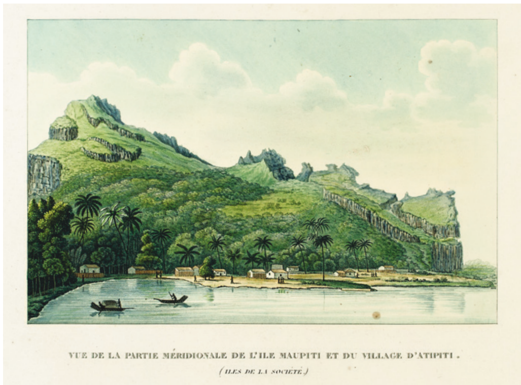
Figure 4. The island of Maupiti in 1823, engraving by Tardieu, after Jules de Blosseville and Chazal. Pl. 18 from Voyage de la Coquille. Atlas histoire du Voyage (1828)

works have treated as a distinct species based on its description under the name Tahiti Yellow Flycatcher ( Muscicapa lutea , Latham) which we do not doubt is the female of the Southern Seas Flycatcher...'. [And finally] 'The old male differs from the previous plumage by its colours which are only two, the black and the white. The first applies to the head, neck and breast; the second applies to the rest of the plumage except for a number of wing feathers which are brown. The bill and feet are lead coloured.'