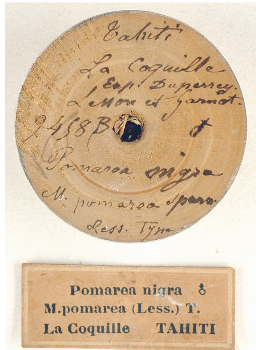
Figure 6. Base of the mount for the pedestal supporting the mounted—but now dismounted—MNHN-ZO-2016-276, syntype of Muscivora pomarea Lesson & Garnot, 1828, and of Muscivora maupitiensis Garnot, 1829, although not taken on Maupiti; Ancien Catalogue no. 9458B

Early records suggest that the MNHN received four adult and four supposed juveniles from 'Tahiti' (J. J. F. J. Jansen in litt. 2018), but evidently some duplicates were not assigned catalogue numbers and now just one adult remains.