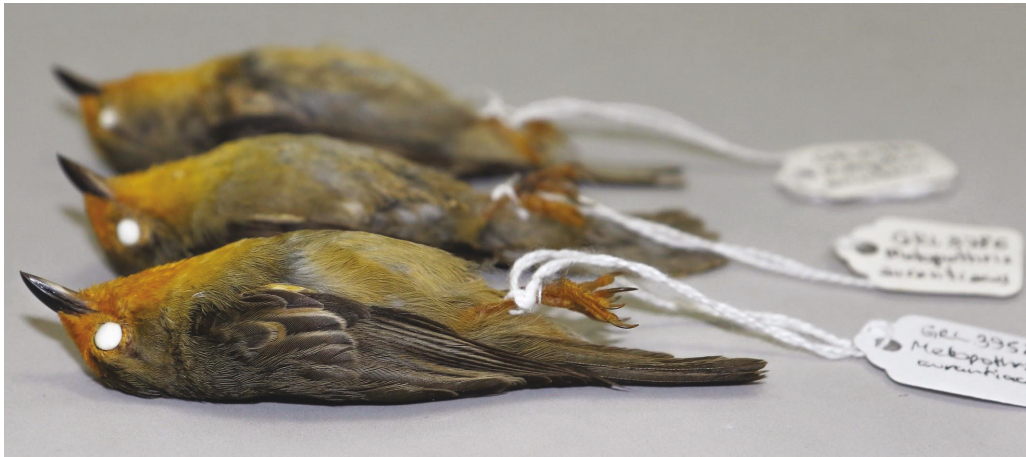
Figure 3. Recent Orange-fronted Plushcrown Metopothrix aurantiaca specimens collected in November 2017 west of Codajás, Amazonas, Brazil (two in background; GRL 3786, GRL 3787) and west of Manacapuru, Amazonas, Brazil (foreground; GRL 3952), housed at the collection at the Instituto Nacional de Pesquisas da Amazônia, Manaus (Cameron L. Rutt)

of Metopothrix was part of a cohesive mixed-species flock. The two birds remained high in the canopy of an emergent tree and neighbouring tall trees where mature várzea borders a strip cleared for sparse habitation. This area is c.800 m from the nearest large river and was not flooded at the time. We presumed the birds to be a pair as one (the putative male) had a much more saturated orange forehead and more vividly orange legs and feet ( http://www.wikiaves.com/2855507 ).