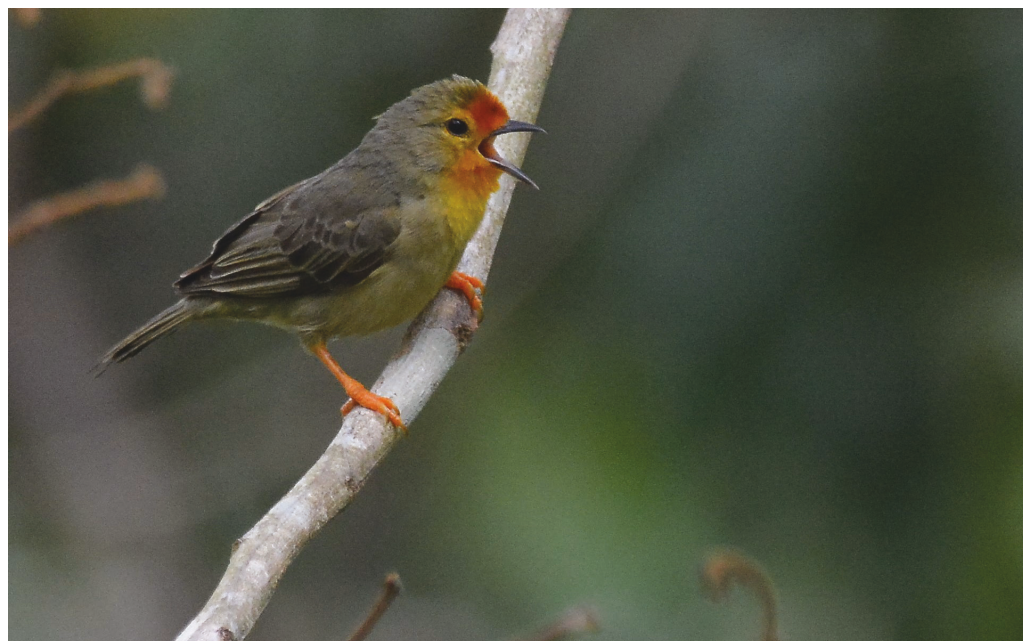
Figure 1. Orange-fronted Plushcrown Metopothrix aurantiaca , Careiro da Várzea, Amazonas, Brazil, 20 October 2018 (Robson Czaban)

Orange-fronted Plushcrown Metopothrix aurantiaca is a unique, small furnariid with bright plumage and tarsal coloration, distinct from other members of its family (Fig. 1; Remsen 2003). This warbler-like bird forages in pairs or small groups and often associates with mixed-species flocks, feeding mainly by gleaning arthropods from vegetation, even