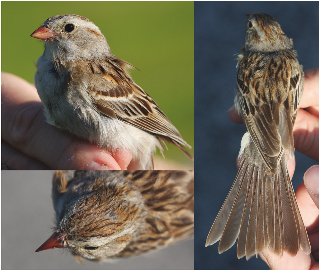
Figure 1. Hybrid Field Spizella pusilla × Clay-coloured Sparrow S. pallida mist-netted in Charlemont Reservation, Lorain County, Ohio, 16 July 2008; the bill and legs have a pink tone resembling Field Sparrow, but plumage characters are intermediate, with a pale malar that is absent in Field Sparrow and rusty tones throughout the body, which are absent in Clay-coloured Sparrow

(1997) reported a range of 59–74 mm for Field Sparrow and 55–63 mm for Clay-coloured Sparrow. We identified the bird as an after-second-year adult, based on the relatively small amount of wear on the broad tips of the rectrices, a lack of moult limit in the primaries and secondaries, and the broad shape and minimal wear to the alula and primary-coverts. These ageing criteria are common to both parental species (Pyle 1997).