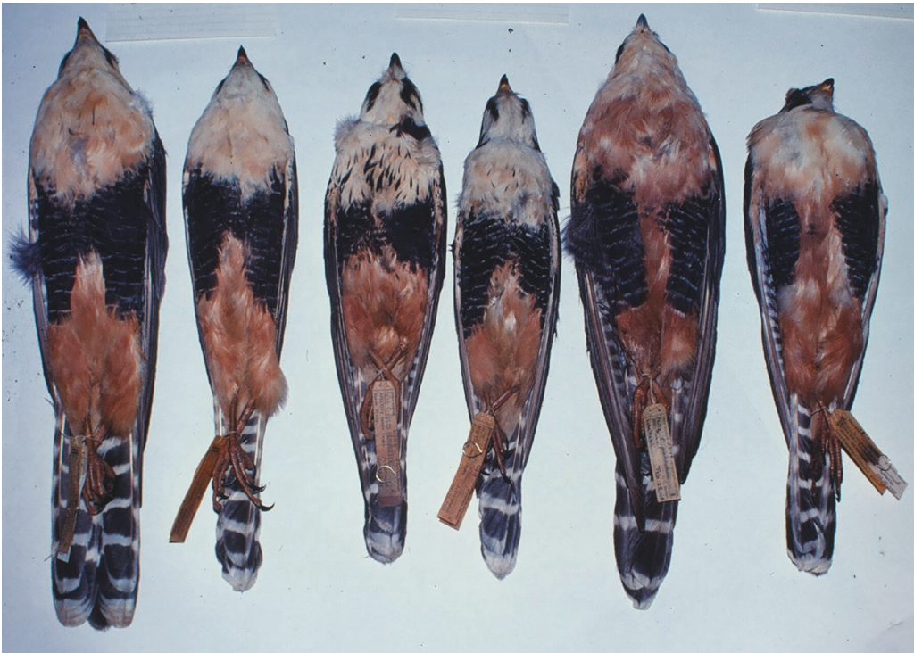
Figure 1. Female and male specimens of Aplomado Falcon subspecies, from left to right: F. f. septentrionalis , F. f. femoralis and F. f. pichinchae

Hellmayr & Conover and emphasised the larger size (than the nominate form), incomplete abdominal band, and darker, more intense coloration.