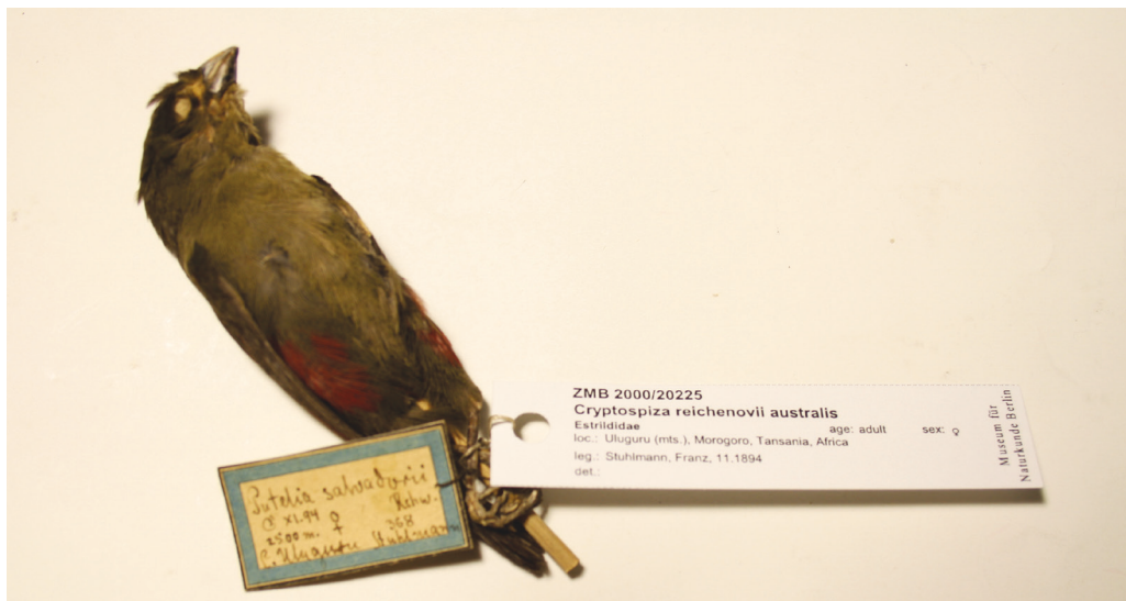
Figure 2. The female Cryptospiza specimen collected by F. Stuhlmann in October 1894 at 2,500 m in the Uluguru Mountains, Tanzania, initially identified as Abyssinian Crimsonwing C. salvadorii (presumably by A. Reichenow) and now correctly identified as Red-faced Crimsonwing C. reichenovii australis , Museum für Naturkunde, Berlin

Birds of Africa (Keith 2004) reported the ranges of wing and tail measurements, respectively, for females of C. salvadorii kilimensis (wing 56–58 mm, mean = 57.0 mm; tail 40–44 mm, mean = 41.9 mm) and C. r. reichenovii (wing 52–57 mm, mean = 53.9 mm; tail 36–41 mm, mean = 39.4 mm). As such data were not provided for C. r. australis , the race in the Eastern Arc Mountains to Malawi and Mozambique (Britton 1980, Keith 2004), we measured seven females of C. r. australis from Malawi, Mozambique and the Uluguru Mountains from the FMNH series. One Uluguru adult female (MCZ 134084) measured 54 and 39 mm for wing and tail, whereas the juvenile female (MCZ 134085) correspondingly measured 50 and 41 mm, respectively. Wing and tail measurements of C. r. australis were 52–56 (mean = 54.9) and 36–40 (mean = 39.2) mm, respectively. Comparing these measurements places the adult MCZ specimen within the range of C. reichenovii rather than C. salvadorii .