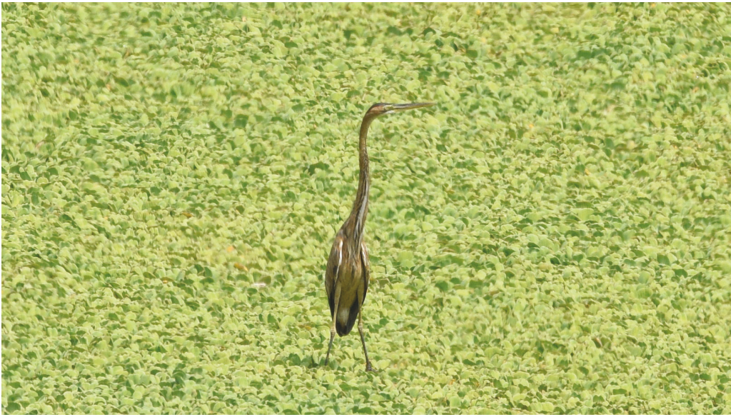
Figure 2. Purple Heron Ardea purpurea , Açude do Xaréu, Fernando de Noronha, Pernambuco, Brazil, March 2017 (Rogério de Castro)

recorded in Brazil: Purple Heron Ardea purpurea , Grey Heron A. cinerea , Squacco Heron Ardeola ralloides , Western Reef Heron Egretta gularis and Little Egret E. garzetta (Silva-e-Silva & Olmos 2006, Fedrizzi et al. 2007, Silva-e-Silva 2008). All records of these species to date are from Fernando de Noronha or Rocas São Pedro e São Paulo, with Purple Heron, Western Reef Heron and Squacco Heron on the former. The many records of Ardeola ralloides suggest it is established on Fernando de Noronha (see Whittaker et al. in press). However, Ardea purpurea was observed only in June 1986, an ‘immature’, which record lacks documentation (Teixeira et al. 1987, Piacentini et al. 2015), and the only record of Egretta garzetta was at Rocas São Pedro e São Paulo (Bencke et al. 2005), a small and isolated group of rocky islets 1,100 km north-east of the coast of Rio Grande do Norte and 630 km north-east of Fernando de Noronha. Here we describe the first documented record of Ardea purpurea in Brazil, and the second for E. garzetta .