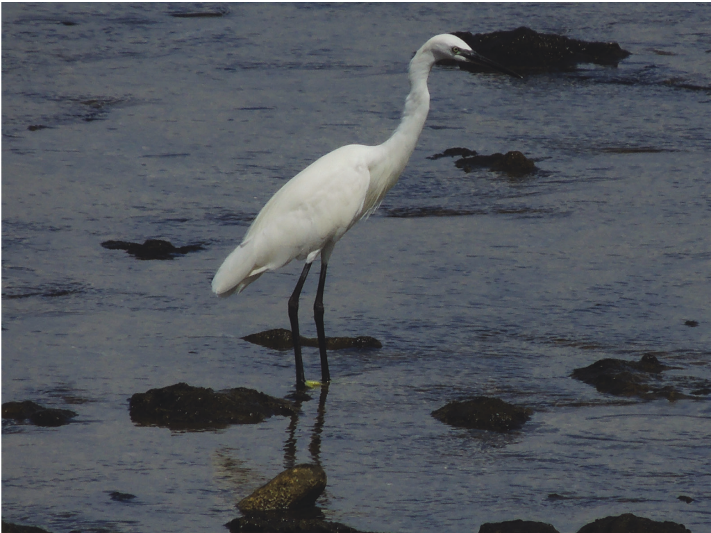
Figure 3. Little Egret Egretta garzetta , Ponta do Air France, Fernando de Noronha, Pernambuco, Brazil, March 2017 (Eduardo Augusto Ferreira)

Western Reef Heron E. gularis is polymorphic in plumage, which can be dark grey, usually with a white throat, white or intermediate, with a mixture of white and grey (Fedrizzi et al. 2007, Martínez-Villata et al. 2019b). The latter species has the eyes lemon yellow, maxilla blackish, mandible yellowish, and the bill overall heavier and more decurved than in Little Egret E. garzetta and Snowy Egret E. thula (Fedrizzi et al. 2007, Kirwan et al. 2019).