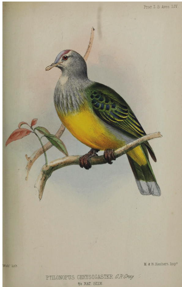
Figure 1. Lithograph of the holotype of Raiatea or Leeward Society Islands Fruit Dove Ptilinopus chrysogaster , by J. Wolf, in Proc. Zool. Soc. Lond. 1853: Pl. LIV

Raiatea or Leeward Society Islands Fruit Dove Ptilinopus chrysogaster is monotypic and currently known from four of the Leeward Society Islands of French Polynesia: Huahine, Raiatea, Taha'a and Bora Bora. It was also reported